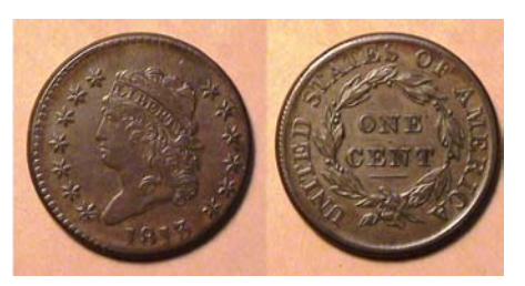
An 1813 Classic Head Large Cent, S-292, R2 grading XF-45 [Enlarge page to 200% in order to view details of coin more clearly]

Both 1812 cents show the large date but a look at the small horizontal bar under the E in ONE on the reverse of the coin directly above demonstrably indicates it's from the same reverse die as the 1811/10 S-286 cent, also far scarier than the S-290 AU-50 example shown above it. While the certified AU version of the S-190 atop the S-191 is a much higher grade and sharper, each coin is attractive in its own way.