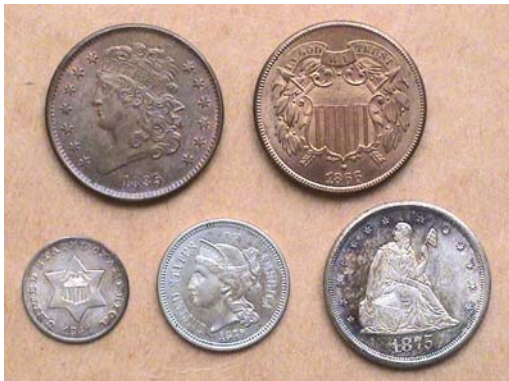
The obverses of an Odd Denominations Type Set From l to right: top 1835 1/2¢, 1866 2¢ Bottom: 1851-O 3¢ silver, 1879 3¢ nickel & 1875cc 20¢ [Magnify page to 200% to see coin details more clearly.]

The difference between an accumulator and a numismatist is one of focus. The accumulator is one who enjoys acquiring various type coins that he or she may fancy at the time but does not appear to focus on the completion of a group of related coins; in other words a "set." be it short or large a large one. The numismatist on the other hand enjoys the challenge of locating that elusive piece that will fill the final hole of a series or a type set whether it be a that of US war nickels (1942-45) or a more ambitious enterprise such as acquiring one sestertius (a large ancient copper coin) for each of the 12 Caesars of Rome. Due to the expense of many US coin types, especially in XF or better, the short set may prove to be the only affordable option for the aspiring numismatist. These can take the form of year sets, proof sets, basic type sets of a single denomination, an odd denominational set or a significant date in world history.