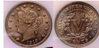
A 1912 Liberty "V" nickel graded AU-55 [Use 3X power glass or magnify page to 200% to view details]

Collecting even common date obsolete US coins in AU or mint-state can be expensive. For young people 18 years or younger, it is virtually impossible yet at the recent SCNA convention held in Greenville, SC there were a number of exhibits that attracted the eye of this attendee that were assembled by young people. One of the displays that caught my attention was an exhibit entitled the "Centennial of a Lost Treasure: The Titanic." The exhibit featured coins dated 1912, the year the Titanic sank after grazing a huge iceberg in the north Atlantic on its maiden voyage from England to the United States. None of the coins were in AU, let alone mint-state but the exhibitor's focus was assembling various coins dated 1912 that enabled her to create an interesting display and it received recognition at the show.