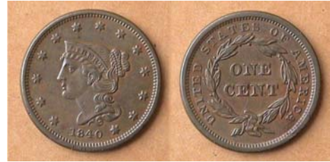
An 1840 Braided Hair large cent, N-1, R2 small date graded XF-40 [Enlarge page to fill monitor screen to view details.]

After 1835, no half-cents were coined for circulation until 1849 when it reappeared with the Braided Hair Mature head design. Before 1849 however, a small number of proof-only specimens were produced from 1840 thru 1848. The 1840 half-cent proof piece shown above is one such example of that type. Only 18 are known which is why this particular coin sold for $7,200 at a Heritage auction in Sept. 2019. It used to reside in the Jules Reiver collection, an outstanding numismatist from Delaware that the author once knew. The problem with half-cent proofs made from 1840 thru 1843 is that during those years Chief Mint Director Christian Gobrecht’s Mature Head design-type didn’t yet exist until it replaced the Petite Head design on the large cent in 1843, so it is now believed that the first three dates of the proof-only ½¢ series must have been back-dated. However, since an 1840 half-cent exists, it can be considered part of the coinage of 1840.