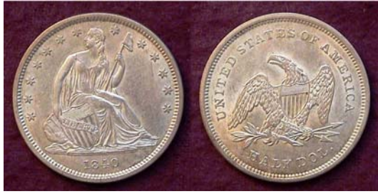
An 1840 Lib. Std. half-dollar WB-101, R3- certified AU-58 [Enlarge page to fill monitor screen to view the details]

This lovely coin was acquired at a Middle Atlantic Numismatic Association Convention held in Cherry Hill, NJ back in October, 1996. It was certified AU-58 when similarly graded coins of that period looked closer to an MS-63 in terms of eye appeal with just a touch of wear. If the reader magnifies the page even slightly, you will see some slight flatness along the upper leg of Miss Liberty on the obverse of the coin. Otherwise the coin appears well struck with decent surfaces.