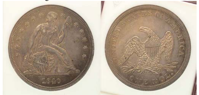
An 1840 Liberty Seated $1.00 graded AU-50 by Anacs [Enlarge page to fill monitor screen to view the details]