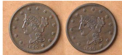
The obverses of both the small and large date versions of the 1840 large cent [Enlarge page to fill monitor screen to view details.]