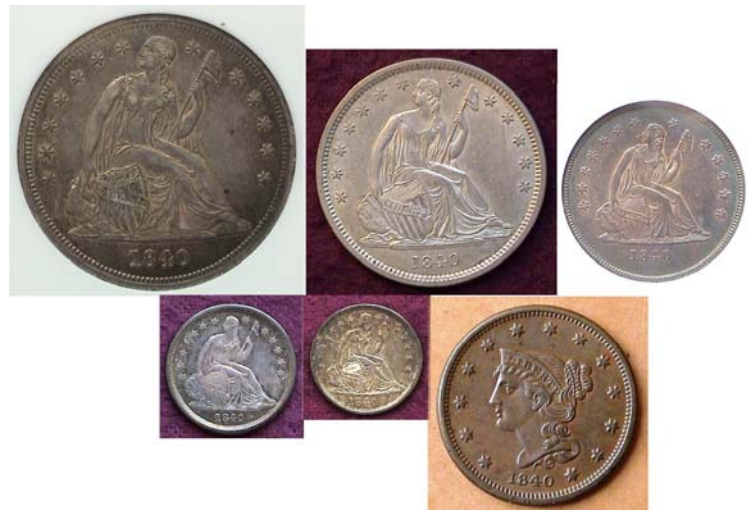
The obverses of the US Coins of 1840 (excluding gold) $1.00, 50c, 25c over dime, half-dime and large cent [Enlarge page to fill monitor screen to view details.]

1840 is regarded as a significant year in United States numismatic history because after 3½ years of revising our coinage by our third Chief Engraver, Christian Gobrecht, the design type of our Liberty Seated silver coinage was finally completed--although in the opinion of many numismatists--artistically compromised from Gobrecht's original 1836 dollar. From then through the end of the Liberty Seated run in 1891, the central Liberty Seated figure remained unchanged. Many of the alterations leading up to this were subtle and probably went unnoticed by the public. These included the no drapery change-over to with drapery under Miss Liberty's gown--where her arm is holding the pole with the Liberty Cap atop--; also, the slanted shield being raised to a vertical position on both the half-dime and dime denominations. Regarding the cent, Gobrecht had been making subtle changes since 1835, continuing through the end of the decade when the Petite Head version of cent first appeared. It would be struck in that form from 1840 thru 1843.