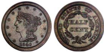
An 1840 original Proof half-cent graded MS-63 by PCGS view details.] [Enlarge page to fill monitor screen to

After 1835, no half-cents were coined for circulation until 1849 when it reappeared with the Braided Hair Mature head design. Before 1849 however, a small number of proof-only specimens were produced from 1840 thru 1848. The 1840 half-cent proof piece shown above is one such example of that type. Only 18 are known which is why this particular coin sold for $7,200 at a Heritage auction in Sept. 2019. It used to reside in the Jules Reiver collection, an outstanding numismatist from Delaware that the author once knew. The problem with half-cent proofs made from 1840 thru 1843 is that during those years Chief Mint Director Christian Gobrecht’s Mature Head design-type didn’t yet exist until it replaced the Petite Head design on the large cent in 1843, so it is now believed that the first three dates of the proof-only ½¢ series must have been back-dated. However, since an 1840 half-cent exists, it can be considered part of the coinage of 1840.