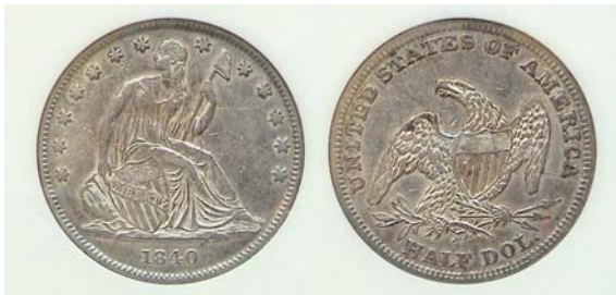
An 1840 (O) Liberty Seated Half-dollar WB-101, R5 graded XF-45, by Anacs

For many years the coin directly above was thought to be a product of the Philadelphia Mint because it lacked the "O" mintmark on the reverse but today it is considered an interesting anomaly and a variety that is coveted by many Liberty Seated coin collectors. It is also known for its numerous die cracks , one obvious one seen on the reverse from the second A in AMERCA going straight into the eagle's wing and a smaller one from the right side of M in America to the top right wing of the eagle.