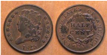
An 1825 Classic Head half, C2, R1 grading XF-40 [Enlarge page to fill monitor screen to view details.]

Unlike the Classic Head large cent, which was struck between 1808 and 1814 in every year of the short run series, the Classic head version of the half cent series had a long and uneven mintage. The coin was struck between 1809 and 1836 but not in every year. In fact there were numerous gaps when none were produced at all. Due to the Latin American Real which was a silver coin slightly larger than our early dismes worth 12½¢, the half-cent was useful in making change. The coin was also required because there were a number of items that were priced at 2½¢ such as books, so the small denomination could be practical.