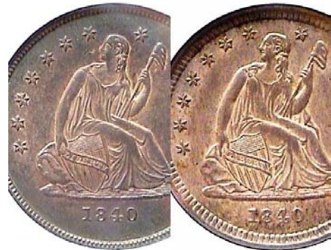
Enlarged details showing the no drapery (at left) and the with drapery at right of the two 1840 Liberty Seated quarters

In the case of the 1840 quarters, the alterations appear to be a little more noticeable than on the half-dime and dime due to the larger size of the coin, however, the shield remains slanted.