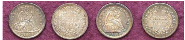
An 1840 Liberty Seated half-dimes with no drapery and with drapery [Enlarge page to fill monitor screen to view details.]

In 1840, a cent had the purchasing power of 31¢.