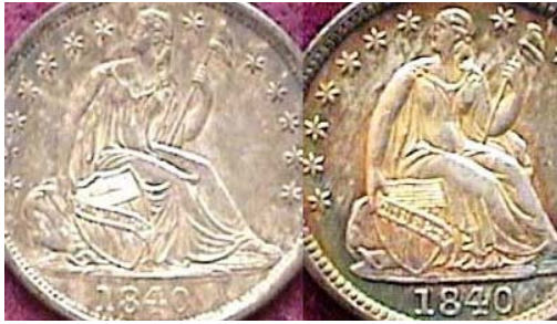
An enlargement showing the details of the no drapery and with drapery half-dimes

From the enlargement of the two 1840 half-dime sub-types shown directly above, the reader can better observe the areas of changes Gobrecht made. The more common no drapery/slanted shield specimen on the left was certified MS-61 while the scarcer with drapery upright shield variety was graded lower at AU-53. The enlargements of the obverses also points out the subtle in the grading of these coins. Despite the fact that the 1840 with drapery appears brighter and more colorful than the 1840 with no drapery , one will observe wear on the leg nearest the shield down to the knee cap where there is no sign of wear in the same area on the coin on the left. Today, the no drapery specimen might grade AU-55. The mintage for the 1840 no drapery half-dime was 1,034,100 while the 1840 with drapery had a mintage of just 310,085 Both versions of the 1840-O (New Orleans) had proportionately lower mintages than the Philadelphia mint output.