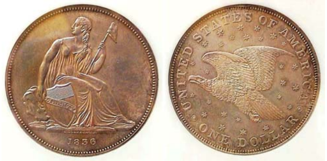
The original 1836 Gobrecht $1.00 graded AU-58 by NGC [Enlarge page to fill monitor screen to view the details]

In 1840, a half-dollar had the purchasing power of $15.30