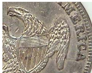
Enlarge to see die cracks

For many years the coin directly above was thought to be a product of the Philadelphia Mint because it lacked the "O" mintmark on the reverse but today it is considered an interesting anomaly and a variety that is coveted by many Liberty Seated coin collectors. It is also known for its numerous die cracks , one obvious one seen on the reverse from the second A in AMERCA going straight into the eagle's wing and a smaller one from the right side of M in America to the top right wing of the eagle.