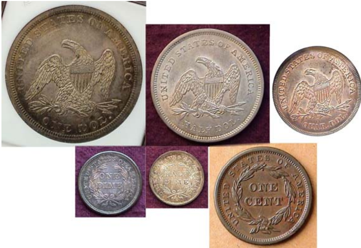
The reverses of the US Coins of 1840 (excluding gold) $1.00, 50c, 25c over dime, half-dime and large cent [Enlarge page to fill monitor screen to view details.]

Until March 4, 1840, Martin Van Buren was serving as our eighth president but due to second greatest depression in U.S. history known as the “Panic of 1837” (which actually didn’t end until 1844), Van Buren was defeated by William Henry Harrison. As a result of Harrison’s long inauguration speech given during a cold damp day outdoors on March 4, 2020, he caught pneumonia and died a month later to be replaced by V.P. John Tyler who was inaugurated as our tenth president on April 4.