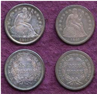
The 1840 dimes with no drapery (Left) and with drapery (Right) [Enlarge page to fill monitor screen to view the details/]

In 1840, a half-dime had the purchasing power of $1.53.