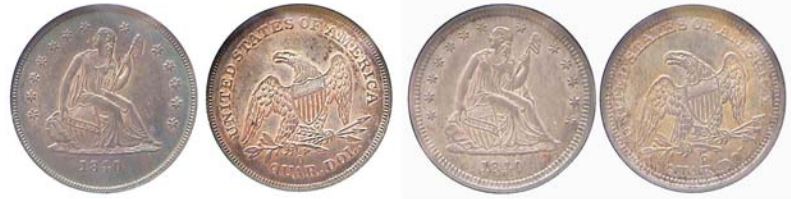
The 1840 no drapery and with drapery Liberty Seated quarters Both were certified and graded AU-58 by NGC when AU-58's looked like MS-63's with a tiny bit of "rub". [Enlarge page to fill monitor screen to view the details/]

In 1840, a dime had the purchasing power of $3.05.