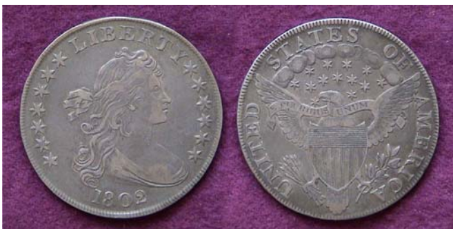
An 1802 Bust/ $1.00, BB-241 (B-6), R1 graded VF-35 by PCGS [Magnify image sufficiently to view details.]

The author acquired the certified VF-25 example shown above in October, 2003 via the internet from a former Colorado based dealer with an excellent reputation for integrity and fair pricing. It cost $1,250 then. Today, similarly certified examples are retailing at $3,500 and selling in that range with lesser appealing examples ranging from $2,500 to around $2,800 according to PCGS' COINFACTS website.