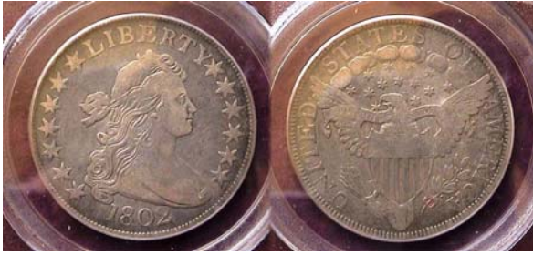
An 1802 Draped Bust half-dollar O-101, R3 graded VF-25 by PCGS [Magnify image sufficiently to view details.]

While the 1802 half-dimes and dimes are considered “stoppers” for most collectors, the 1802 Draped Bust Heraldic silver half-dollar and dollar--although still fairly expensive--are both on the cusp of accessibility. These two denominations along with the cent can be considered the “feast” for the collector willing to save up to obtain any one of them.