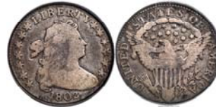
An 1802 Draped Bust dime, JR-4, R4 graded VG-10 by PCGS Realized $2,820 at a Heritage Sale in Feb. 2016,

While the vast majority of serious collectors may never be able to come up with the financial wherewithal to acquire such an example we can still appreciate its toned beauty as one does a great work of art in the museum. There are two higher graded examples of the 1802 half-disme but none as attractive.