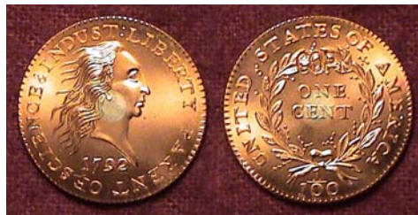
A Gallery Mint Replica of the 1792 Birch Cent