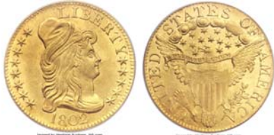
An 1802 $5.00 half-eagle graded MS-65 by PCGS CAC approved The coin sold for $138,000 at a Heritage auction held in January, 2012 at the FUN Show in Orlando, FL

Although no 1801 normal date $5.00 half-eagles were produced for circulation, a reported mintage of 53,176 Draped Bust/ Heraldic half-eagles were struck at the Philadelphia mint in 1802 but with the 1802/1 over-date. This was the second largest mintage of the short series which ran thru 1807 but due to the slight overweight of our early gold issues, many were either sold or melted for their greater value over face thereby adversely affecting the supply for collectors of a later generation. The early Draped Bust gold half-eagle had a diameter of 25 mm. As such it is not only a perfectly sized coin for use in commerce but a beautiful work of art as well. Our first Chief Engraver Robert Scot set a very high bar for other engravers to follow.