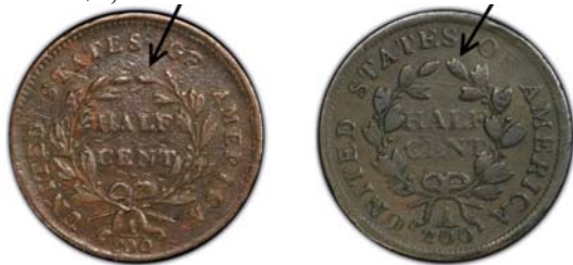
REVERSE OF 1800

The reported mintage for the 1802 Draped Bust half-cent was just 20,266 pieces, the lowest for the Draped Bust series (1800-1809) but not the lowest for the denomination. That credit goes to the 1796 Flowing hair designed half-cent with only 1,390 pieces reported struck. The 1802/0 half cent came with two major die varieties, the first known as the “Type of 1800” featuring one leaf on the top right side of the wreath located on the reverse, a R6, (extremely rare) and the other subtype, “Type of 1802”, designated R3, (scarce but collectible) shown atop the page. The coin displayed was acquired for $490 in May of 1989 at a major show held in northern New Jersey and was accompanied by a Photostat of the item from the original ANACS corporation which was a subsidiary of the American Numismatic Association at the time. Current auction records show the average prices realized for the more available 1802/0 ‘Type of 1802’ is now around $1,700 with a suggested retail price of $2,200.