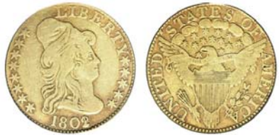
An 1802/1 $5.00 half-eagle graded Fine-12 by PCGS

While most collectors are unlikely to acquire any mint-state specimen of the 1802/1 $5.00 half-eagle, it is conceivable that there are some avid numismatists with both the knowledge and the discretionary income to save up for a certified AU-58 specimen such as the coin shown directly above. There are a number of less desirable coin types and "rarities" that sell for a lot more money.