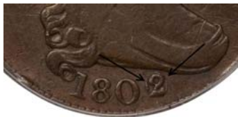
Detail of over date which appears on both 1802/0 half-cent varieties [Magnify image sufficiently to view details.]

The three diagnostics, courtesy of PCGS' COINFACTS