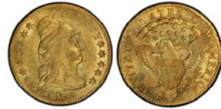
An 1802/1 $2.50 quarter eagle graded PCGS-64 by PCGS The coin sold for $211,500 at the D. Brent Pogue sale conducted by Stack's Bowers in May, 2015 [Magnify all images to sufficiently to view details.]

Only two of the three gold denominations authorized in the first Coinage Act of 1792 were issued with the 1802 date, the $2.50 quarter eagle with a reported mintage of only 3,035 and the $5.00 half-eagle with a mintage of 53,176. Both were struck as over-dates, ( 1802/1) No $10.00 eagles were struck in 1802.