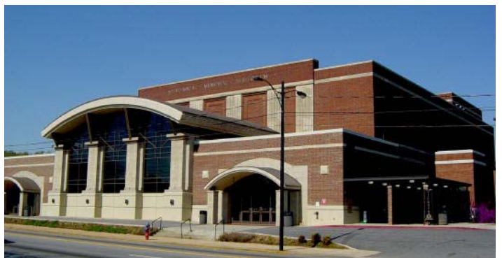
Spartanburg Memorial Auditorium 385 N. Church Street Spartanburg, SC 29303