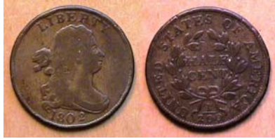
An 1802/1 Draped Bust half-cent, C-2 R3- graded VG-8 by ANACS [Magnify image sufficiently to view details.]

The reported mintage for the 1802 Draped Bust half-cent was just 20,266 pieces, the lowest for the Draped Bust series (1800-1809) but not the lowest for the denomination. That credit goes to the 1796 Flowing hair designed half-cent with only 1,390 pieces reported struck. The 1802/0 half cent came with two major die varieties, the first known as the “Type of 1800” featuring one leaf on the top right side of the wreath located on the reverse, a R6, (extremely rare) and the other subtype, “Type of 1802”, designated R3, (scarce but collectible) shown atop the page. The coin displayed was acquired for $490 in May of 1989 at a major show held in northern New Jersey and was accompanied by a Photostat of the item from the original ANACS corporation which was a subsidiary of the American Numismatic Association at the time. Current auction records show the average prices realized for the more available 1802/0 ‘Type of 1802’ is now around $1,700 with a suggested retail price of $2,200.