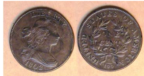
An 1802 Draped Bust large cent, S-237, graded VF-35 [Magnify image sufficiently to view details.]

The US Coins of 1802 (215 years ago) by Arno Safran