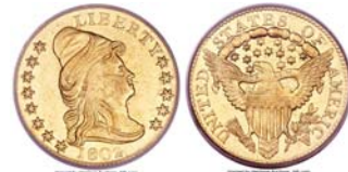
An 1802/1 $2.50 quarter eagle, this one graded AU-58 by PCGS The coin realized $25,300 at a Heritage auction back in Aug. 2010

The reported mintage for the 1802/1 $2.50 quarter eagle was a scant 3,035 and while not the rarest of the short Draped Bust series (1795-1807), it is expensive across the grading spectrum. The lowest grade example the author observed was a Fine-12 specimen that realized $3,738 in a Heritage auction back in 2005. In May, 2015, the D. Brent Pogue specimen shown above cost the winning bidder $211,000, $21,000 more than the suggested retail figure