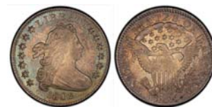
An 1802 Draped Bust dime, JR-4, R4 graded MS-62 by PCGS It realized $82,500 at the same D. Brent Pogue Sale #1 held in May of 2015 by Stack's/ Bowers [Enlarge to 200% to view the beautiful details of this coin.]

The 1802 Draped Bust/ Heraldic Eagle disme had a reported mintage of 10,975 with four known die varieties, the Variety 4 being the most common. The authors of Early United States Dimes: 1796-1837 believe perhaps 20,000 or 22,000 were actually coined, many in 1803 but with the 1802 date. While not as rare as the 1802 half-dime, the 1802 dime is still fairly expensive. The coin shown directly above realized $2,820 grading just VG-10, and when enlarged to 500%, shows what appears to be a wavy scratch across Liberty's forehead. Otherwise the piece looks original and problem-free. That said, it is unlikely such an example will appear in a Show & tell session at our club including the gem specimen shown below..