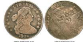
An 1802 Draped Bust half-disme graded Good-6 by PCGS It sold for $58,000 at the FUN Show held in Orlando, FL in Jan., 2012 [Magnify images on this page sufficiently to view details.]

The 1802 Draped Bust/ Heraldic eagle half-disme ( as the denomination was spelled ) had a reported mintage of just 3,060 and is currently considered to have a survival rate of around 35 pieces, mostly in very low grades with none certified as uncirculated. Since five cents had the purchasing power of around $1.15 in 1802, (23 nickels), the coin had some “value” during that timeframe with the result that it circulated heavily. The diameter of the tiny silver coin was just 16.5 mm. The planchet was quite thin and prone to becoming bent if mishandled, a factor in locating problem-free pieces.