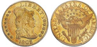
Another 1802/1 $5.00 half-eagle, this one graded AU-58 by PCGS It realized just $11,750 at a Heritage auction held in August, 2017

Although no 1801 normal date $5.00 half-eagles were produced for circulation, a reported mintage of 53,176 Draped Bust/ Heraldic half-eagles were struck at the Philadelphia mint in 1802 but with the 1802/1 over-date. This was the second largest mintage of the short series which ran thru 1807 but due to the slight overweight of our early gold issues, many were either sold or melted for their greater value over face thereby adversely affecting the supply for collectors of a later generation. The early Draped Bust gold half-eagle had a diameter of 25 mm. As such it is not only a perfectly sized coin for use in commerce but a beautiful work of art as well. Our first Chief Engraver Robert Scot set a very high bar for other engravers to follow.