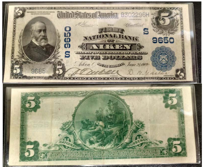
A rare $5.00 Series three National Banknote from the First National Bank of Aiken, SC