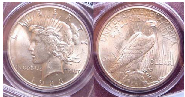
A 1928 Peace dollar graded MS-63 by PCGS [Enlarge page to fill monitor screen or 150% to view details.]

The Peace $1.00 was struck from 1921 thru 1928 at three mints, Philadelphia, San Francisco and Denver, then again in 1934 and '35 before being retired due to low circulation. The 1928-P used to be considered the key date of the series but the 1934-S has overtaken it in grades from AU-50 and above in Mint state grading MS-65 and above. The Peace dollar would be the last US silver dollar intended for circulation . The dollar types that followed were clad. The current silver dollar eagle is a bullion coin based on what an ounce of silver is currently worth between 24 and 25 times than an actual dollar bill.