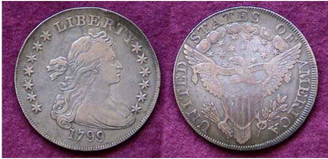
A 1799 Draped dollar with Heraldic Shield, B-13, R6 graded VF-30 by PCGS

[Enlarge page to 150% or fill monitor screen to view details.]