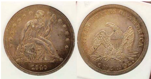
An 1840 Liberty Seated $1.00 graded AU-50 by Anacs [Enlarge page to 150% or fill monitor screen to view details.]

Alas! All good things sometimes come to an end!