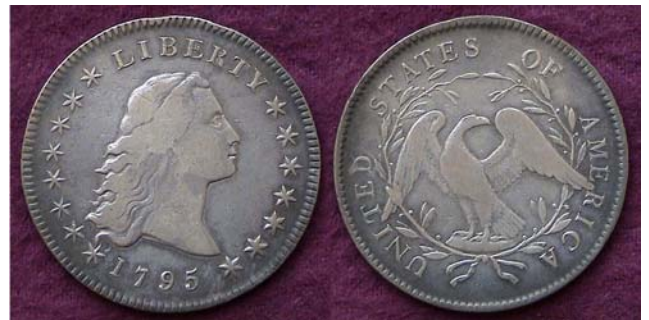
A 1795 Flowing Hair Silver dollar, B-2, R2 graded Fine-15 by PCGS [Enlarge page to 150% or fill monitor screen to view details.]

Pictured above is our first silver dollar coin type. It was created by Robert Scot, the first chief engraver of the US Mint. The Flowing Hair type was first struck in 1794. It had a diameter of 39-40 mm and a reported mintage of just 1,758 pieces and is very rare and beyond the means of most collectors in all grades. An AG-3 specimen will cost $40,000 while a MS-60 is currently priced at $1,000,000 according to the Red Book . That doesn't mean one cannot acquire the type, because fortunately, the Flowing Hair dollar was produced again in 1795, this time with a reported mintage of 160,295 and is affordable in the grade shown, Fine-12 to 15.