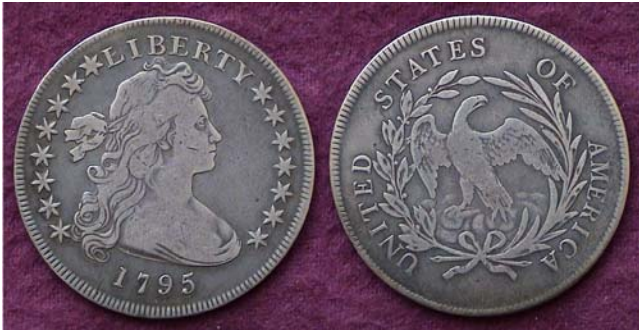
A 1795 Draped Bust-Small eagle Silver dollar, B-14, R3 graded Fine-15 by PCGS

One of the nice things about residing in the Delaware river valley was the plethora of monthly shows. A month later, there was another show; this time held in Montgomeryville, PA, a town roughly thirty miles northwest of Philadelphia just off the Pennsylvania Turnpike, AKA I-76. Here, the author came across another 1795 silver dollar but it did not have the same obverse design. The diameter of 39-40 mm and silver to copper ratio remained unchanged but this new type displayed a more majestic and attractive version of Miss Liberty on the obverse known as the Draped Bust type. It too was graded Fine-12, and appeared as a perfect match to the Flowing Hair coin-type.