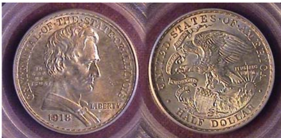
A 1918 Lincoln Commemorative half-dollar graded MS-63 by PCGS, OGH

Our first series of commemorative coinage was produced from 1892 thru 1954. In the earlier years, a number of them were the creation of our Chief Engravers such as Charles Barber and George Morgan. While most commems were struck on the half-dollar, some appeared on the quarter, the silver dollar as well as the gold $1.00 and $2.50 quarter-eagle and finally on a $50.00 gold coin struck to commemorate the Panama-Pacific Exposition, held in 1915. It would not be until 1926--in celebration of our sesquicentennial--when the last gold denominations would be used. In 1918, the year that the Illinois centennial half-dollar was created, most commems that were coined were usually struck on half-dollar planchets.