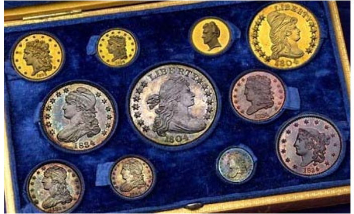
The obverses of the 1834 US uncirculated coin set presented to the King of Siam, which in addition to the 1804 dollar, shows the re-striking of the 1804 $10.00 gold eagle in the upper right and a small Andrew Jackson Medal--to its left--who was serving in his second term as president at that time.

In 1804, the Mint continued to strike 1803 Draped Bust dollars but none were dated, 1804 since it was already decided to suspend the striking of silver dollar coinage which would not officially resume on a consecutive yearly basis until 1840, five years after the famed 1804 Draped Bust/ Heraldic dollar was struck. This occurred in 1835 along with the re-striking of the Draped Bust $10.00 gold eagle, neither of which were intended for circulation but as part of a complete group of US coin denominations dated 1834--from copper thru gold--to be presented to foreign potentates in different parts of the world.