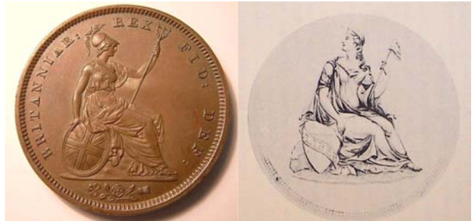
An 1825 British Penny, left, & Thomas Sully's sketch for his version of the Lib. Std. obverse design for the new dollar coin, right