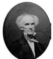
James Barton Longacre

Longacre made subtle changes ending in 1856 with the Indian Princess type dated 1873 shown between the two silver dollars. The three examples displayed are affordable and still attractive as graded if one saves up for them prior to attending a major show