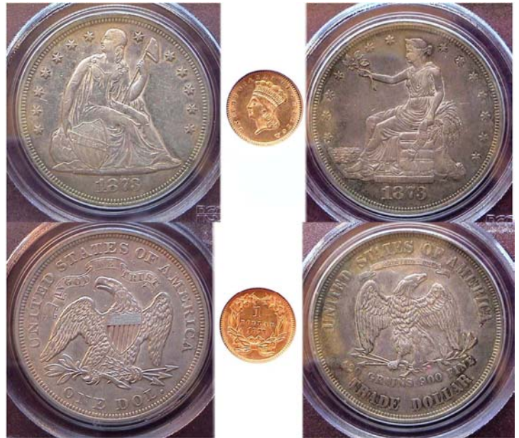
The dollars of 1873, the Liberty Seated with motto, graded AU-55 by PCGS, the gold Indian Princess dollar graded MS-61 by NGC and the first year of the Trade dollar graded XF-45 by PCGS

To make matters more confusing for collectors, restrikes of the various trial pieces of the Gobrecht dollar continued to be re-struck for collectors during the 1850s and '60s showing the eagle either soaring upward or in a horizontal position with the 1836, 1838 or 1839 date.