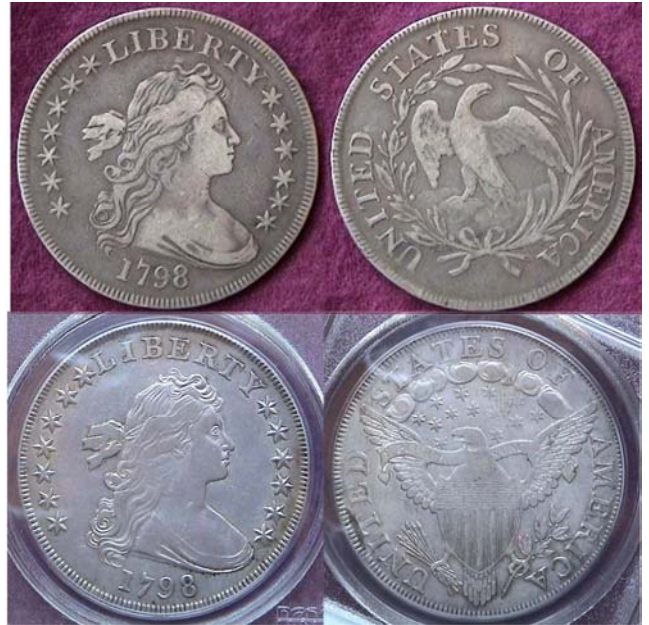
A 1798 Transitional pairing of the Draped Bust dollar with the small eagle reverse on top and Heraldic large eagle reverse below

In 1798, the Philadelphia Mint struck 327,536 Draped Bust silver dollars, but a small fraction of these still portrayed the small eagle on the reverse. Of those, 30,000 showed the original 13 stars on its obverse while just 10,000 were struck with 15 stars as a result of Vermont and Kentucky having recently entered the union. If one subtracts 40,000 from the 327,546 struck in 1798, the number of coins produced that year with the Heraldic Eagle reverse comes to 287,536, still a fairly larger amount. As a result, the 1898 small eagle sub-type is considered scarce to rare due to its low survival rate and most examples usually surface in grades from Fine to VF-25 while the 1898 dollar with the Heraldic eagle reverse is considered common. This explains disparity in the grades of the two examples although the cost of each coin were virtually the same.