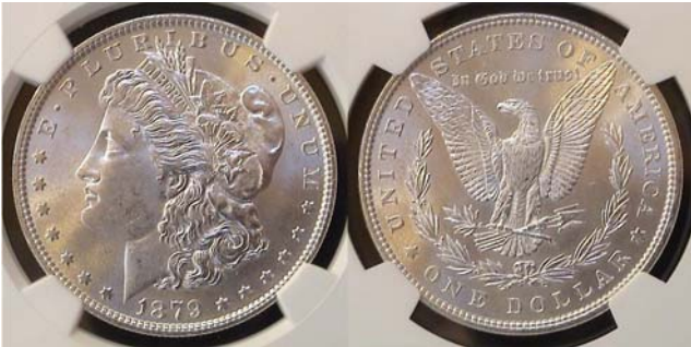
An 1879 Morgan dollar graded only MS-63 by PCGS ? [Enlarge page to fill monitor screen or 150% to view details.]

In 1878, the Bland Allison Act gave the western silver mining companies an enormous economic boost since one of the