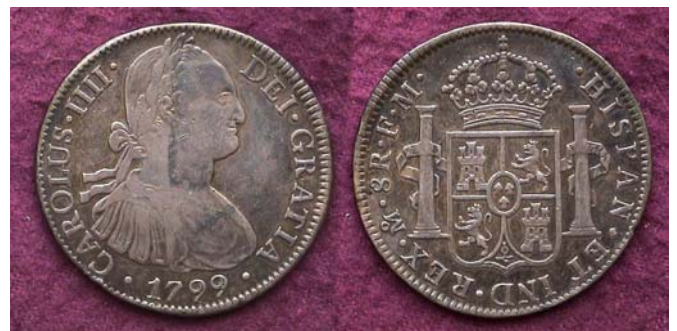
A 1799 8 Reales ($1.00) struck at the Mexico City Mint [Enlarge page to 150% or fill monitor screen to view details.]

Back in 1992, the author acquired this VF graded Mexican Peso featuring King Charles III of Spain for just $40. The type was struck from 1791 thru 1808 at the Mexico City Mint and had virtually the same silver content as our own dollar coinage. It circulated heavily here since our supply of silver for coinage was rather puny back then.