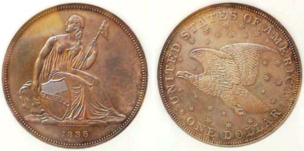
An 1836 Gobrecht Liberty Seated dollar graded AU-58 by NGC [Enlarge page to 150% or fill monitor screen to view details.]