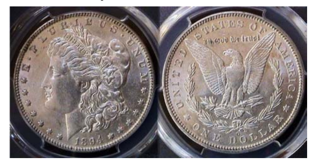
An 1894-O Morgan dollar graded AU-55 by PCGS [Magnify page to fill monitor screen to view details more clearly.]

The 1879-P graded MS-63 shown above had a mintage of more than 14.8 million and represents one of the many affordable issues priced between $60.00 thru the $85.00 levels whereas the 1894-O shown below can be acquired closer to the $200.00 echelon.