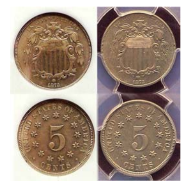
1873 Shield Nickel with close 3 and open 3 in date [Enlarge page to fill the monitor screen to view details.]

In 1873, the Shield nickel--as with most of the denominations coined that year--was struck with a close three and later with an open three in the date because the chief coiner at the time, A. Lowden Snowden informed Mint Director James Pollock that the close three resembled the number 8 too closely. With some denominations, it is the close three that is the scarcer of the two and with others it is the open 3. While the current 2020 Red Book lists the mintage for the 1873 open 3 Shield nickel as 4,113.950 compared with just 436,050 for the close three, renowned numismatic scholar, Q. David Bowers in his Guide Book of Shield and Liberty Nickels (2006) estimates that based on the evidence of the frequency of the appearances of the close 3 version, it represents the greater number of survivors despite the ten to one ratio favoring the open 3 in the date. When the author was endeavoring to complete the business strike portion of his Shield nickel set during this past decade, he found it much more difficult to find an attractive higher circulate grade to mint state 1873 open three Shield nickel at the at the