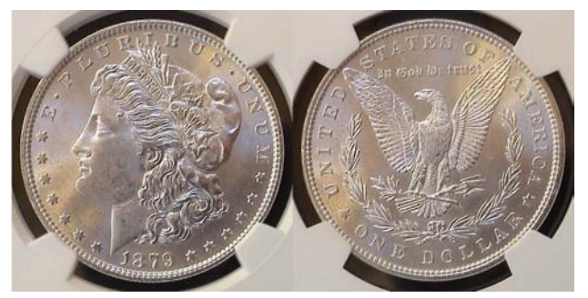
An 1879-P Morgan dollar graded MS-63 by NGC [Magnify page to fill monitor screen to view details more clearly.]

Four US Date Sets that can be Completed By Arno Safran