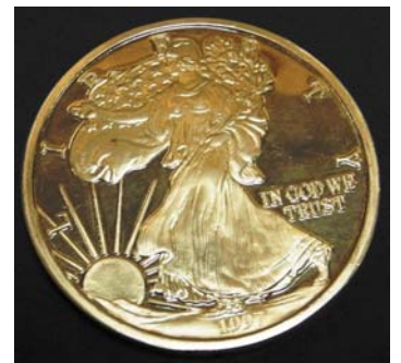
J.J. Engel displaying a counterfeit "sterling" 1 lb, silver plated eagle The picture of the bullion coin is reduced to fit the page.