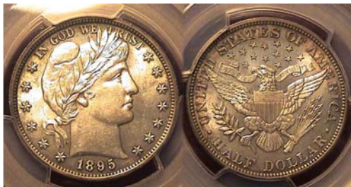
An 1895-P Barber half-dollar graded MS-63 by PCGS [Enlarge page to fill monitor screen to view image more clearly]

In 1895, a quarter had the purchasing power of $7.85.