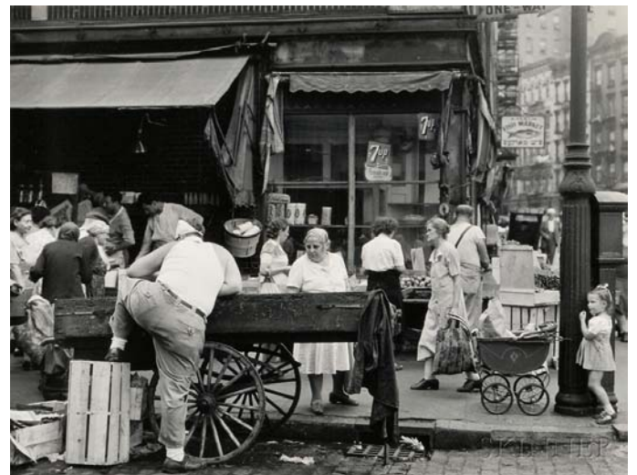
Little girl with doll carriage at NYC Outdoor Market in 1895