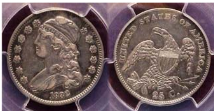
An 1832 Small Capped Bust quarter graded XF-40 by PCGS [Enlarge page to fill monitor screen to view image more clearly]

While some local coin shops are reopening, most major shows have been cancelled resulting in Greater “on line” acquisition and auction activity