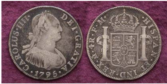
A 1795 Mexican Four Reales silver coin, KM-100 graded VF-20 [Enlarge page to fill monitor screen to view image more clearly]

Pictured above is an 1795 Four Reales silver coin that was struck at the Mexico City Mint 225 years ago. The KM-100 stands for Krauss/ Mishler, the two well known numismatists who attributed the variety for collectors of this series. The obverse shows the portrait of King Charles III (IV) of Spain while the reverse displays a crown over the Spanish Coat of Arms and the pillars of Hercules on each side designating the two hemispheres, East and West based on the Renaissance era in which the exploration of the Western hemisphere was encouraged. Such a coin could have circulated in the early United States although it is somewhat doubtful that the low mintage four reales denomination actually did.