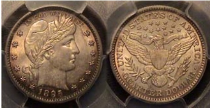
An 1895 Barber quarter graded MS-63 by PCGS, CAC approved [Enlarge page to fill monitor screen to view image more clearly]

In 1895, the Philadelphia Mint struck 4,440,000 Barber quarters, the New Orleans Mint, 2,816,000 and the San Francisco Mint, just 1,764,681 and they are priced accordingly with the Philadelphia Mint issue costing well below the price of either the 1895-O or 1895-S today.