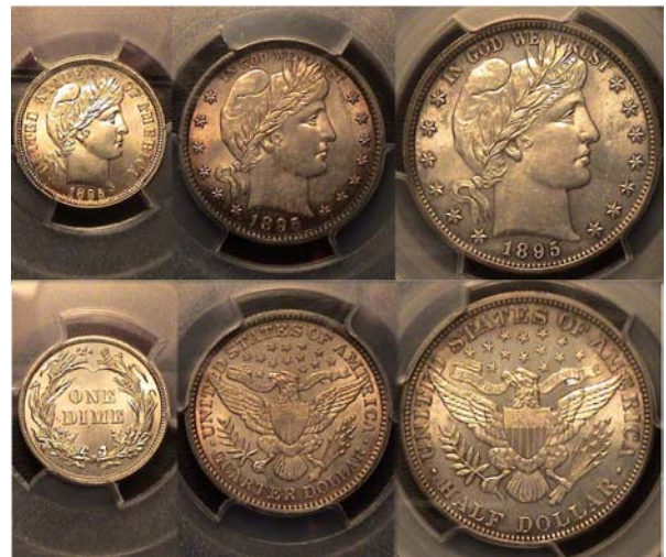
The uncirculated 1895 Barber Silver dime, quarter and half-dollar [Enlarge page to fill monitor screen to view image more clearly]

On payday, the workers received cash in a small manila envelope which undoubtedly had a few Barber silver coins and Liberty nickels inside it. If upon opening the envelope, the breadwinner spotted a shiny new dime, quarter or half, its significance was in all likelihood zero because the labor force of that era could not afford to put a way a cent, let alone a beautiful Barber dime, quarter or half since every coin was essential to provide for the family's needs. This is why collectors from the 1930s on seldom found Barber coins out of circulation graded above VG-10 let alone BU specimens which were kept in family heirlooms by the wealthy class.