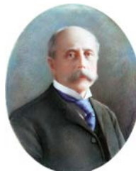
Charles Edward Barber

In last month's feature article we covered the US Coins of 1890 which displayed the penultimate Liberty Seated designs on the dime, quarter and half-dollar first introduced in the late 1830s. Two years later they were gone; replaced by Charles Barber's Liberty Head designs, which despite a number of negative comments over the years, are regarded as favorites with many collectors today.