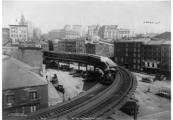
The NYC Elevated train rounding the curve in Manhattan in 1895