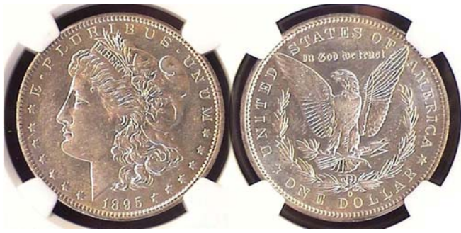
An 1895-O Morgan $1.00 graded AU-50 by NGC

[Enlarge page to fill monitor screen to view image more clearly]