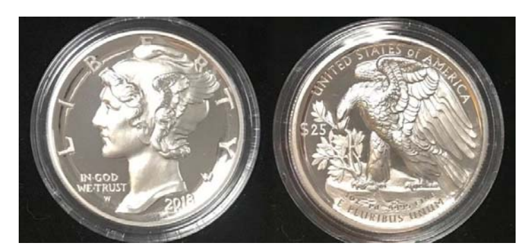
A dollar-sized Mercury dime obv. with Weinman eagle reverse

The coin has a high relief Mercury dime design obverse and a reverse with a different eagle from the Mercury dime, perhaps akin to the one Adolph Weinman used for the reverse of the Walking Liberty half-dollar. This one was derived from the 1907 American Institute of Architects gold medal reverse with the eagle grasping a branch. Jim also had a 5 oz silver coin produced on a curved planchet that the U.S. Mint produced for the 50th anniversary of the moon landing. It had the same design as the 1 oz dollar coin.