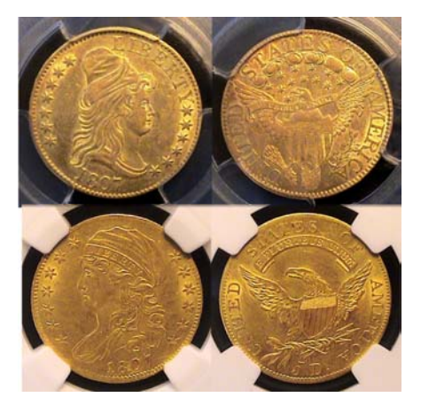
Another positioning of the 1807 $5.00 gold transitional dates paring Showing Robert Scot's Draped Bust design-type Over John Reich's Capped Bust (The pair of a lifetime for this collector!)

Many collectors enjoy the challenge of collecting transitional date parings of coin types struck in the same year. Over the almost 227 year period the US Mints have been striking coins, there have been a large number of situations were an outgoing coin type coin was replaced by a new one during the same year, defining a transitional date. Transitional parings are easy to obtain when both types struck in the same year are fairly common such as the 1938-D Buffalo nickel and 1938 Jefferson nickel. Even in MS-66, neither coin is that expensive as to deny the collector the opportunity of obtaining both. In the case of the 1916 Barber and Standing Liberty quarters, both the 1916-P & D Barber guarters had combined mintages of 8.3 million while the 1916 Standing Liberty quarter had a reported mintage of just 52,000 and although many were saved as a first year issue, the SL quarter has a retail value of $3,000 in the grade of only Good-4 up to $15,000 for an MS-63 according to the 2020 Red Book with Gem MS-65s Full head specimens going for $35,000, a "stopper" for most collectors!