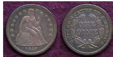
An 1840 Liberty Seated dime with drapery graded XF-45 by NGC

Shown above are two uncirculated Indian Head cents featuring a tough date such as the 1875 and an extremely common one, the 1903. There is no question that the 1903 cent at right is well struck with a vibrant red color but if you enlarge the images the reader will notice that despite only being graded MS-64 RB ( Red Brown ), the 1875 piece has a very attractive coppery tone with a strong strike including nice surfaces as well. Despite a mintage of 13½ million for the 1875 cent compared with 85 million for the 1903, the survival rate for the 1875 is much lower in proportion to its mintage than the 1903 and priced considerably higher across the entire grading spectrum. Today, an 1875 cent grading MS-64 RB is listed at between $500 and $625 according to the PCGS on-line Price Guide whereas the price spread for the 1903 in the same grade is listed at between $125 and $140. The highest known grade for the 1875 is an MS-66 RD ( Red ) and it realized $13,800 at a Heritage auction The current seller is asking $1,500 for the 1903 MS-67 RD specimen while the PCGS price-guide lists it at guide lists such a graded piece at over $10,000 but is it really worth it?