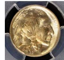
1913-P Type 1 Ind. Head Nickel Graded MS-67 by PCGS

[Enlarge image to fit monitor screen to better view details.]