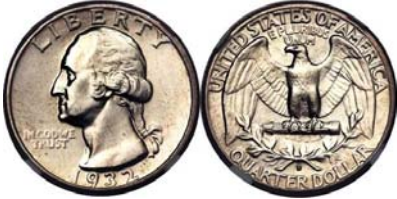
A 1932-D Washington Quarter graded MS-65 by NGC

[Enlarge image to fit monitor screen to better view details.]