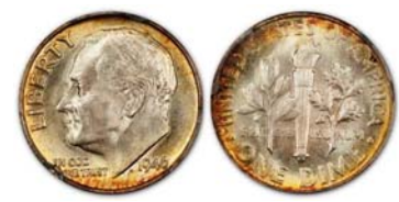
A 1946-P Roosevelt dime with full bands on reverse graded MS-67+ by PCGS

Above are slightly larger images of the long obsolete 1840 Liberty Seated Type 1 with stars dime shown "raw" but later graded XF-45 by NGC alongside the 1946-P Roosevelt dime certified MS-67+FB ( for full bands on the reverse ) by PCGS. The 1840 dime was produced in two sub-types: 1.175 million were struck with the no drapery version at New Orleans and slightly less than a million at Philadelphia, 981,560. The design type was then severely altered by Robert Ball Hughes on instructions by Mint Director Robert Maskell Patterson resulting in drapery being added to Miss Liberty's gown and the shield moved from a slanted to an upright position. The with drapery version was struck only at the Philadelphia Mint with a reported mintage of just 377,500 . Compare that figure with the 225,250,000 struck by the Philadelphia Mint for the 1946 Roosevelt dime although Full Bands specimens on the reverse are much less common. The 1946-P dime grading MS-67+FB is listed at over $1,000 on PCGS's on-line price guide compared with $475 for the 1840 with drapery dime grading XF-45 Despite the grade differences, which do you regard as the better value?