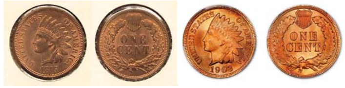
An 1875 Indian Head cent Graded MS-64 RB by ICG

Based on the coin grading scale of Poor 1 to MS-70 , a perfect coin, the MS-67 certified specimen shown of the 1932-P quarter is only two grades higher than an MS-65 specimen yet the current price a major national coin dealer is asking for the 1932-P MS-67 example is a whopping $22,500 , almost three times higher than the key date 1932-D. If you think that's high, the PCGS on-line price guide lists it at over $35,000 in bold red print. As a rule, most MS-65 graded coins have a lot of eye appeal as the key date 1932-D quarter pictured demonstrates. The MS-67 graded 1932-P is unquestionably a magnificent specimen but it still represents an extremely common date which begs the question; Given the choice between the two coins shown--assuming you could afford either--which would you choose as a collector or investor?