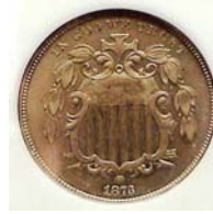
1873 closed 3 Shield nickel Graded MS-62 by NGC