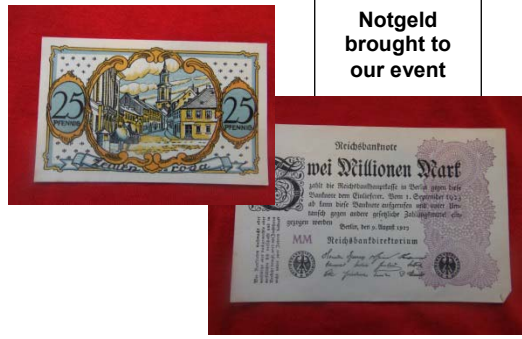
Notgeld brought to our event

A great big THANK YOU!!!! To all our volunteers that help make our event a success!