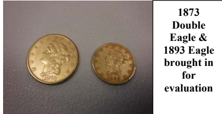
1873 Double Eagle & 1893 Eagle brought in for evaluation

True to our imperative of Education in Numismatics, the Stephen James CSRA Coin Club hosted a Coin & Currency identification day on Saturday, June 11 th 2016. And you never know what will be brought in - it's so exciting!!