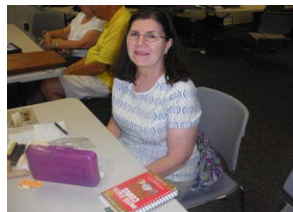
Winner of a Red Book