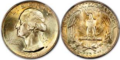
A 1932-P Washington Quarter graded MS-67 by PCGS