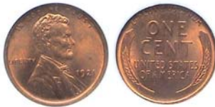
A 1921-P Lincoln cent graded MS-64 RD by NGC [Enlarge page to fill monitor screen to view details.]

With the exception of the Morgan dollar which had huge mintages at all three Mints, all the other 1921 dated denominations--including the Peace dollar were low mintage issues, some with severe drops in numbers from the previous four years. The plunge was due to a post WWI economic recession as the nation attempted to adjust its economic needs from a wartime to a peacetime economy.