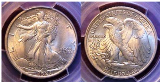
A 1921-P Walking Liberty half-dollar graded MS-63 by PCGS [Enlarge page to fill monitor screen to view details.]

After the 1916, Standing Liberty quarter the 1921 is the scarcest Philadelphia Mint issue. The 25c coin was struck only at the Philadelphia Mint that year with a reported mintage of 1,916,000, a drop of 25.9 million from the 27,860,000 struck at the Philadelphia Mint in 1920. According to J. H. Cline, a Standing Liberty quarter dealer and author of the book on the series, the 1921 issue is generally well struck but a lot scarcer than one would believe. "We routinely have more 1916 quarters in stock than the 1921 or 1923-S." The certified MS-63 specimen shown was acquired at the FUN Show held in Orlando, FL in January, 2010 but has the eye appeal of a 64.