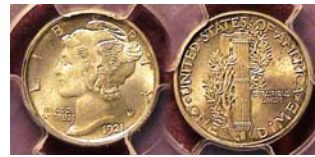
A 1921-D Mercury dime graded MS-64 Full Bands by PCGS [Enlarge page to fill monitor screen to view details.]

The specimen shown was acquired at the Georgia Numismatic Association Convention in April, 2010. It was housed in an obsolete PCI holder graded MS-64 and by its appearance was well struck coin with ample luster and eye appeal having no distracting marks. The dealer however, priced it as a MS-63, possibly because the now defunct company's reputation for grading was not as stringent as PCGS or NGC. Before purchasing for grading, I showed the coin to a couple of respected dealers and both thought the coin to be a legitimate MS-64. In 2012, curiosity got the best of me. I decided to crack out the 1921 nickel and submitted it “raw to NGC. It came back as a 63. Since I was into the piece for '63 money, any slight disappointment I may have felt, soon ebbed, because many seasoned collectors have observed grade inflation across the board by grading companies--which they refer to as “market grading”--that include rare to scarce date coins to extremely common date Morgan and Peace dollars, so who knows, maybe the 1921 nickel would come back a MS-64 holder today. In 1921, the 5c nickel coin was the workhorse of the economy.