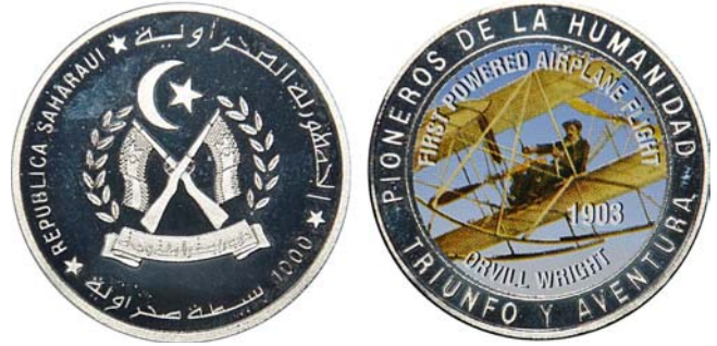
A 1997 Western Sahara 1,000 Pesetas

The Ukraine also issued a non-circulating Wright Brothers coin in 2003 at the 100th Anniversary of World Aviation and the 70th Anniversary of their National Aviation University. It is a smaller 31mm coin weighing 12.8 grams and is Nickel and Silver in composition. The value is 2 Hryvni. 30,000 were minted.