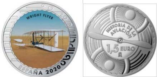
A 2020 Wright Brothers First Flight commemorative Euro coin of Spain

This year 2021, the Solomon Islands issued a 25 and 100 Dollar Pioneers of Aviation coin is that is part Mother of Pearl, one in gold and one in Silver. Both feature Elizabeth II on the front and Orville and Wilbur with their Wright Glider on the reverse. The silver coin weighs 155.5 grams and is 65mm in size and the silver is .999. Only 750 were minted. The 100 Dollar gold coin is quite a coin to look at. Same weight and size as the silver coin, it is .999 Gold. One site I saw listed it for $15,999 US. According to Numista.com, there were only 25 made.