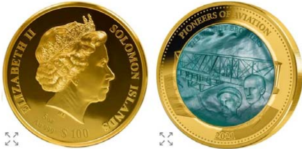
A 2021 $100 gold coin from the Solomon Islands

This year 2021, the Solomon Islands issued a 25 and 100 Dollar Pioneers of Aviation coin is that is part Mother of Pearl, one in gold and one in Silver. Both feature Elizabeth II on the front and Orville and Wilbur with their Wright Glider on the reverse. The silver coin weighs 155.5 grams and is 65mm in size and the silver is .999. Only 750 were minted. The 100 Dollar gold coin is quite a coin to look at. Same weight and size as the silver coin, it is .999 Gold. One site I saw listed it for $15,999 US. According to Numista.com, there were only 25 made.