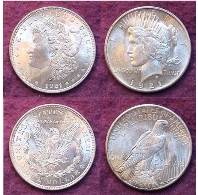
1921-P Morgan and Peace dollars The Morgan $1.00 was graded MS-65 and the Peace $1.00 MS-62 [Enlarge page to fill monitor screen to view details.]