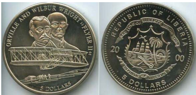
A 2000 $5.00 coin from the Republic of Liberia

Also from the Isle of Man in 1995 was a One Crown .925 Silver non-circulating Isle of Man in Flight coin. It weighs 28.28 grams, and is 38.5mm in size 30,000 coins were minted. All proof. A Copper-nickel version of the same coin was also made that same year.