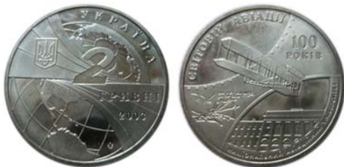
A 2003 Ukrainian 2 Hryvni coin

In 2020 Spain issued a 1½ Euro Wright Flyer colored coin that is Copper-Nickel; weighs 15 grams and is 33mm in size. This was part of "History of Aviation" series. 7,500 were minted.