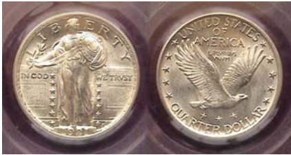
A 1921 Standing Liberty Quarter graded MS-63 by PCGS [Enlarge page to fill monitor screen to view details.]

After the 1916, Standing Liberty quarter the 1921 is the scarcest Philadelphia Mint issue. The 25c coin was struck only at the Philadelphia Mint that year with a reported mintage of 1,916,000, a drop of 25.9 million from the 27,860,000 struck at the Philadelphia Mint in 1920. According to J. H. Cline, a Standing Liberty quarter dealer and author of the book on the series, the 1921 issue is generally well struck but a lot scarcer than one would believe. "We routinely have more 1916 quarters in stock than the 1921 or 1923-S." The certified MS-63 specimen shown was acquired at the FUN Show held in Orlando, FL in January, 2010 but has the eye appeal of a 64.