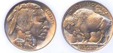
A 1921-P Indian Head/ Buffalo nickel graded MS-63 by NGC [Enlarge page to fill monitor screen to view details.]

Of all the Philadelphia Mint issues of the Buffalo nickel, the two most difficult dates to find in mint state are the 1918 despite a mintage of 32 million and the 1921 with only 10.6 million struck compared with 63 million in the previous year. Neither date however is considered comparable in rarity to a number of branch-mint dates from the teen years and 1920s.