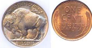
BU reverses of our 1921 denominations excluding the $1.00 50c, 25c and Denver mint 10c over 5c & 1c [Enlarge page to fill monitor screen to view details.]

Excluding gold, a 1921 year set consists of six denominations, the bronze cent, five-cent nickel along with the silver dime, quarter, half-dollar and dollar. Actually two silver dollar coin types were struck that year; the resumption of the Morgan dollar after a hiatus of seventeen years for a final “last hurrah”--as it were--and the introduction of the new Peace dollar, emblematic of a world at peace first struck three years after the armistice that concluded World War I.