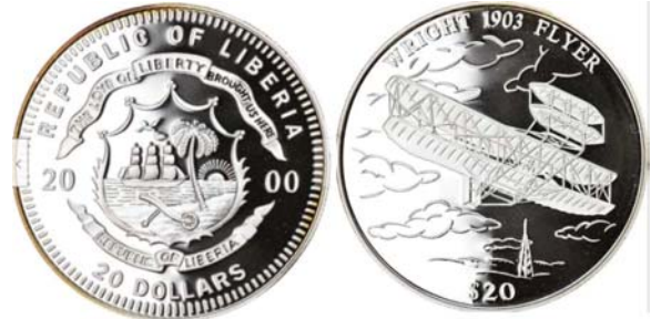
A 2000 Republic of Liberia $20.00 .999 fine silver coin Commemorating the 1903 First Flight

In 2000, the Republic of Liberia issued a Five and Twenty dollar coin. The Five Dollar coin is 40mm (about 1.57 inches) and weighs 32 grams and is Copper-nickel. Five dollars in Liberia is worth about 3 US Cents. 20,000 were minted according to Numista.