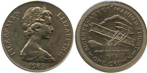
An 1983 British Crown from the Isle of Man

Much of the following comes from Numista , a terrific source of information.