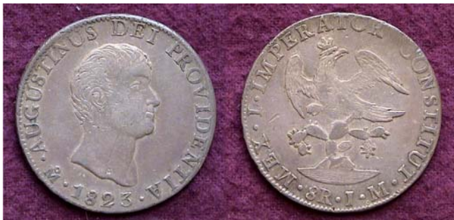
An 1823 8 Reales showing Augustin Iturbide on the obverse and a crowned eagle on cacti on the reverse [Enlarge page to fill monitor screen to view details more clearly.]

The War of Independence by Mexico against Spain lasted 12 years, (1810-1822) when General Augustin Iturbide--who entered the battle rather late--declared himself, Imperator . During his short rule, 1822 and '23, his portrait appeared on the obverse of the silver and gold coinage, and throughout those two years of service, he proved to be dictatorial for which the Mexicans--after 12 years of war with the former mother country, Spain, had little appetite. So, the Mexican army forced him to resign and exiled him with the proviso that if he ever returned he would be summarily arrested and executed.