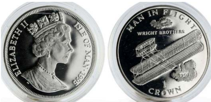
Another Isle of Man Crown, this one a proof, dated 1995 featuring Queen Elisabeth II on the obv. & the first flight on the rev.

In 1983, the Isle of Man created a One Crown Copper-nickel non-circulating 200th anniversary of Manned Flight (from 1783, must have been a balloon ?) It weighs 28.47 grams and is 38.61mm in diameter. 50,000 were minted.