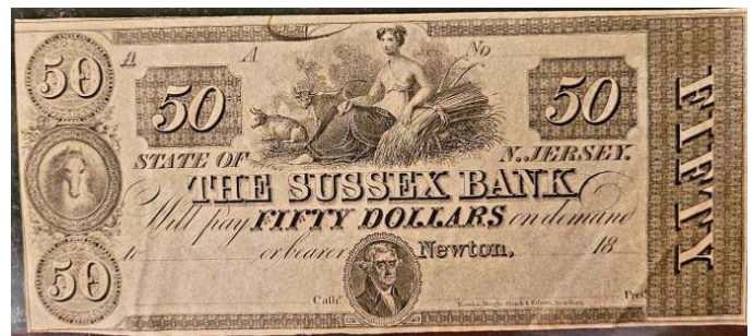
A $50.00 Bank note from the Sussex, NJ Bank. The reverse side was probably blank as a number of such notes showed only the face.

The note was graded Very Good but is still considered rare.