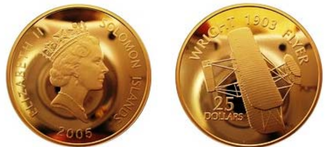
A 2005 Gold plated silver coin

In 2011, New Zealand issued a 1 Dollar .925 Silver non-circulating coin from the How Man Conquered the Skies series featuring the Wright Brothers. It was a rectangular 40 x 28 mm coin that weighs 29.28 grams. Only 6,000 were minted but not in New Zealand. Instead, they were struck at the Warsaw Mint in Poland.