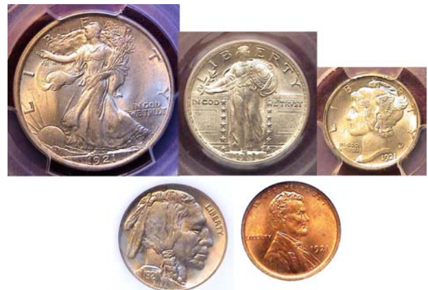
BU obverses of our 1921 coinage (excluding the $1.00) [Enlarge page to fill monitor screen to view details.]

Years ago, the writer aspired to assemble uncirculated US coin sets from the current year which at the time was 1976, gradually going back in time. The Bicentennial anniversary of the Declaration of Independence stimulated a return to coin collecting that had begun during his teen years but abruptly ended when he could not explain to his father why he was spending $4.50 for an 1825 Bust dime graded AU-53 on his $2.00 a week allowance. In the late 1970s, there were lots of coin shops including some in the malls. If you were a regular, the dealer would allow you to search through uncirculated rolls of coins to form BU year sets. A number of eye appealing fairly attractive Franklin halves were acquired that way. Over the years as his interest grew, he started to seek coins from the 1940s and 1930s but obtaining coins struck prior to 1934--the year dealers began putting away rolls of uncirculated coins--stopped his “habit” in its tracks. Years later, when he had become better numismatically educated he found some attractive “raw” coins from the 1920’s such as a 1923-S WL half dollar but back then, he never had the money to acquire a BU 1921 Mercury dime, SL quarter or WL half-dollar even approaching XF-45, let alone, one in uncirculated condition.