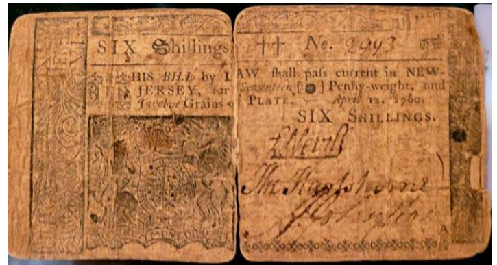
A rare April 12, 1760 colonial 6 Shillings note from New Jersey

The note was graded Very Good but is still considered rare.