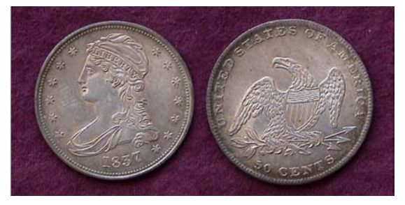
An 1837 Reeded Edge half-dollar graded AU-58 [Use 3x glass or enlarge page to fit monitor screen to view details.]

In 1837, 25c had the purchasing power of $6.39.