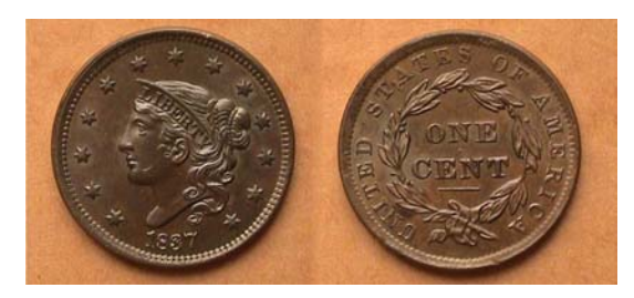
An 1837 large cent with beaded hair cords, N-11, R1, graded AU-58 [Use 3x glass or enlarge page to fit monitor screen to view details.]

The reported mintage fir the 1837 Coronet large cent was over 5.5 million. Shown directly above is a pleasing example of a 1837 large cent with plain hair cords. Of the seventeen known varieties, thirteen appear with the plain hair cords and four with the beaded hair cords ( AKA "the Head of '38" )... The coin was acquired at the NJ state convention in July, 1994.