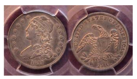
An 1837 Reduced size Bust quarter, B-2, R1 graded AU-50 by PCGS [Use 3x glass or enlarge page to fit monitor screen to view details.]

In 1837, a dime had the purchasing power of $2.56.