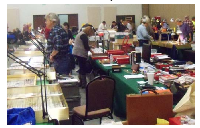
The Augusta Coin Club had over 300 patrons attend its Fall show [Enlarge page to fill monitor screen to view image more clearly.]

The Augusta Coin Club will be holding its spring show on May 19 and 20, Fri. & Sat. from 9 AM to 5 PM at the Columbia County Expo Center. The site is located just off Exit 190 of I-20 in Grovetown, GA. From Aiken or North Augusta, upon exiting, turn left and proceed' to the Gateway B'lvd. Traffic light turning left there, then .drive past the shopping area down the hill and make a right into the Convention Center parking area.