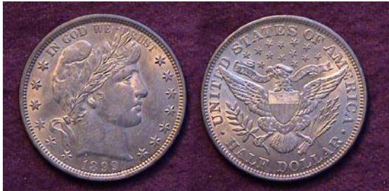
An 1899-P Barber Half dollar grading AU-58 The mintage was 5,538,000 for the Philadelphia Mint issue representing the high water mark of the entire 73 coin series. [Magnify to 200% to see details.]

With over 12.6 million quarters struck at the Philadelphia Mint in 1899, a collector should have no trouble picking up an attractive specimen within a grade range of VF-30 up through MS-63 depending on your budget.