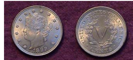
An 1899 Liberty nickel grading AU-58. The mintage was 26,027,000. [Magnify to 200%]

With a few exceptions most Indian Head cents dated from 1880 on are considered common and moderately priced up through MS-63 and the 1899 cent with a mintage of over 53,500,000 is one of them. Back in 1987, you could still find a nice MS-65 Red specimen for around $30.00. Indian cents have increased in value quite a lot since then. Today it is advisable to look for a certified specimen graded Red-Brown to full Red. That said, even a well struck Brown MS-64 may be considered a “best buy” in today’s market.