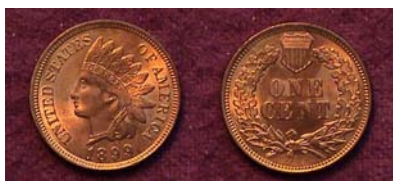
An 1899 Indian Head cent grading MS-65 Red 53,598,000 were struck [Magnify up to 200%]

I have always enjoyed collecting decade anniversaries based on the current year. This being 2009, one could highlight dates of significance ending in nine. Around the turn of the previous century I was delighted to discover that the coins struck at the Philadelphia Mint for the most part were coined in prodigious numbers with enough AU to BU survivors still available at affordable prices within budget over time. This was true not only for 1900 but for the immediate years following and preceding. Thus we come to 1899, a group of six coins ( excluding gold ) that was produced eleven decades ago.