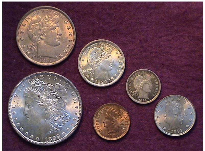
The obverses of an 1899 Year set [Magnify to 200%]

Many a numismatist became a coin collector upon receiving a birth year coin set from a loving aunt, uncle or grandparent. When my older son got married some years ago, in addition to the wedding present for the bride and groom, I presented him along with his three siblings a set of proof coins representing the year of their birth. The more modern year sets can be assembled from government packaged uncirculated sets or proof sets. From 1965 on, most of these are inexpensive. In fact, some of these sets going back to 1957, which feature three silver coins including the long obsolete Franklin half, are still relatively "cheap" in both proof or in uncirculated condition. For older US year sets, one may have to seek circulated specimens due to lower survival rates. The V nickel and Barber half in the 1899 set shown are both AU's but still attractive.