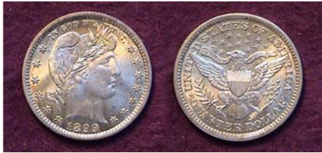
An 1899-P Barber Liberty Head quarter graded MS-62 The mintage was 12,624,000 [Magnify to 200%]

With the 1899 25¢ coin we come to the first of the three “big” denominations of this year set. Ridiculed and berated by later numismatists and politicians as lacking artistic imagination in his designs, Charles E. Barber in 1899, was in the midst of his tenure as Chief Engraver of the US Mint in Philadelphia and had four of his design types then in circulation; the Liberty nickel (since 1883), the Liberty Head dime, the quarter and half dollar (all since 1892). He was also the designer of the commemorative Columbian Exposition half dollar (1892 & 1893) and Isabella quarter (1893).