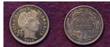
An 1899 Barber dime grading MS-63 Proof-Like [Magnify to 200%]

Like the Indian Head cent, the 5¢ Liberty “V” nickel is generally considered to be a common coin type with most dates priced inexpensively; the exceptions being such key dates as the 1885, 1886, 1912 D and 1912 S issues. The 1899 with a mintage of over 26 million is easily affordable in AU up through MS-63. The AU example shown cost $40 when it was acquired in 1990. Today, the Coin Dealer Newsletter’s Monthly Supplement lists an AU-50 at only $47.00, a MS-60 at $70.00 and just $110 for a MS-63. While these are wholesale figures, one could hardly call my original purchase a good investment. My purpose then was to form a year set having eye appeal at very little cost which represented a portal to my grandparents’ era as newlyweds. Rarity was not a priority.