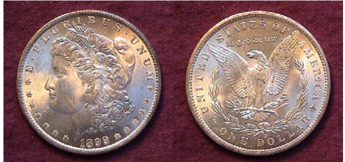
This 1899-O Morgan dollar was certified MS-63 PQ by PCGS but only cost $23.00 back in the late 1990’s.

The final denomination; the Morgan dollar is the most popular yet the least expensive in mint state of all the others in the set. That’s if the collector opts for the 1899 New Orleans Mint issue with 12,290,000 struck as opposed to only 330,000 for the much scarcer 1899-P issue. The 1899-S has a mintage of over 2.5 million but is even rarer in mint state than the 1899-P. Back in 1899, a dollar had the purchasing power of $26.50.