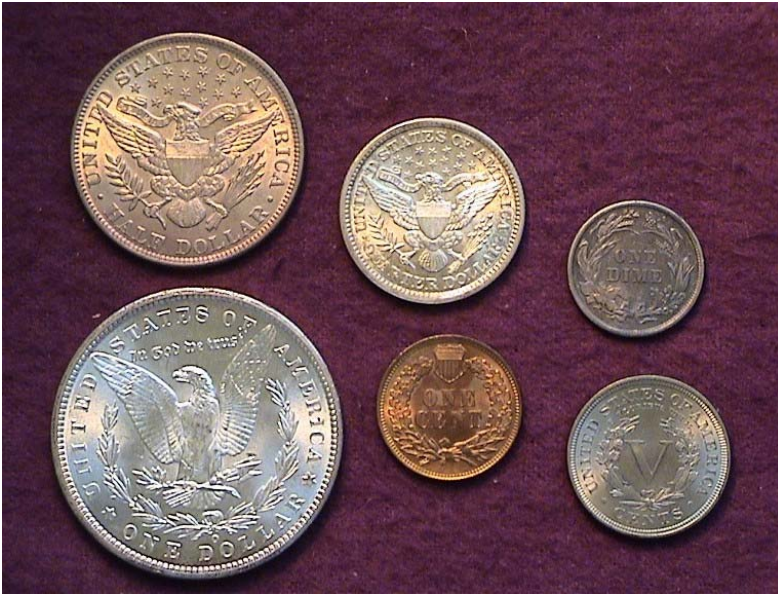
The reverses of an 1899 Year set. [Magnify to 200% to see details.] The Morgan dollar was struck at the New Orleans Mint.

I started collecting in 1976, our bicentennial year and like many neophytes, I began by assembling modern year sets in uncirculated condition going back in time towards my youth. Since I grew up during the “WWII” years I was pleasantly surprised to discover as late as the 1980’s, most dates and Mints were still relatively affordable in MS-63 to MS-64 condition and many are still comparatively inexpensive today.