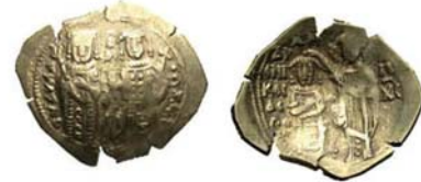
An example of a crudely struck debased scyphate silver hyperpyron from the reign of Andronicus III (1328-1341) Obv., Anna of Savoy I, regent of John V, r. standing and facing Rev., Andronicus III kneeling before Christ (Sear #2466) The coin was between 24 mm and 25 mm in diameter.