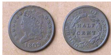
An 1809 Classic Head ½¢, C-6 R1 grading VF-30

Based on Greg Heim’s half cent article we will feature another half cent type; this one, the Classic Head (1809-1836) as coin of the month. As a series the half cent is still undervalued according to many numismatists and attractive problem free specimens such as the one above sell for under $100.