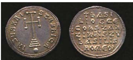
Basil I, 867-886 miliaresion (silver) ca. 26 mm; Sear 1708 Obv., Cross potent on three steps, globe beneath, Rev., inscription