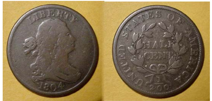
An enlargement of the 1804 Draped Bust 1/2¢, Cohen 7 variety R4 the photo was taken by the author.

ANSWER: From my study of the series I know that this is a tough variety to fine, even in pleasing Fine-12 or better. Color and surfaces play a MAJOR role in the pricing of early US copper. In my judgment, the dealer is not being unreasonable in his asking price. If one is a specialist in this series, I believe the purchase has to be made. If it coin in question is a secondary or tertiary option then I would give the entire floor a lap and return as soon as possible to reassess my position.