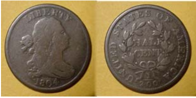
An 1804 Draped Bust Half Cent, C-7 R4 (actual size) From the author's collection

The year 2007 marks by thirty-third year in Numismatics. Over that time I have developed a variety of strategies as they apply to acquiring coins for my collection. Some of these may not be for you, so please read what follows with an open mind.