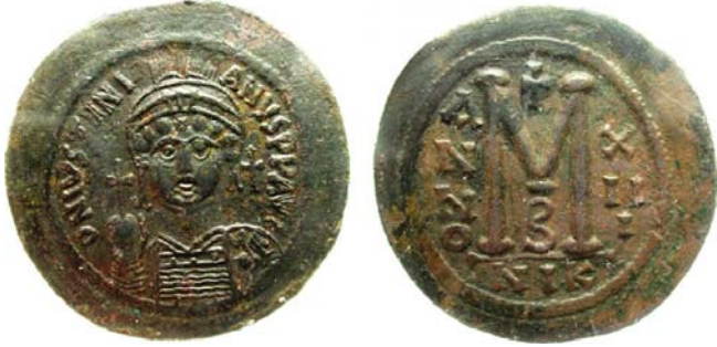
A follis of Justinian I, Byzantine emperor from A.D. 527-565 Under Justinian I, this copper coin was 42 mm in diameter.

This specimen was struck in Nicomedia in the 13 th year of the emperor's reign. The obverse shows a crowned facing bust of the emperor holding a globus cruciger; (cross). The reverse shows the denomination as a large M; [the Greek symbol for 40 nummi which was equal to one follis.] (Photo and description courtesy of Heritage auctions Archives)