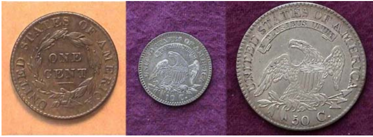
The reverses of the collectible coins of 1823 The Coronet cent, Capped Bust dime and Half-dollar

Under the provisions of the Coinage Act of 1792, ten denominations were authorized, two in copper, the half-cent and large cent, five in silver, the half-disme, disme, quarter, half-dollar and dollar and three in gold, the $2.50 quarter eagle, $5.00 half-eagle and $10.00 eagle. During the first fifty-six years of our coinage which began officially in 1793, the striking of all ten denominations in a single year occurred just once, in 1796. During the early years, gold and silver were in short supply and our copper planchets had to be imported from the firm of Matthew Boulton in Soho, Birmingham England. From 1805 thru 1830, several of our denominations were suspended or struck erratically. Americans living during this period depended on the many Latin American silver coins to supplant the low mintage US pieces which contained .903 fine silver and accepted by tradesmen as payment for goods sold. In 1823, The US Mint in Philadelphia struck only five denominations, the cent, dime, quarter, half-dollar and $5.00 half-eagle