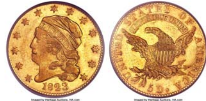
Another 1823 Cap Head $4.00 half-eagle, this one certified AU-55 by PCGS and more affordable

At 25 mm in diameter, the early $5.00 half eagles of the United States were the perfect coin both functionally and artistically. The 1823 dated $5.00 half-eagle is not considered the scarcest date for its type. (1813-1829) but it is unlikely that many collectors will be able to afford one because only 100 survivors may exist for the date according to numismatic scholar Ron Guth. During this era, a large number of $5.00 half-eagles were either sold or melted for profit when the gold value of the coin increased above its stated face value in relation to silver.