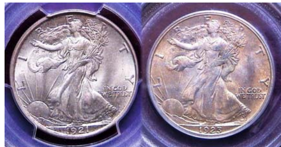
Comparison of strongly and weakly struck WL half-dollars