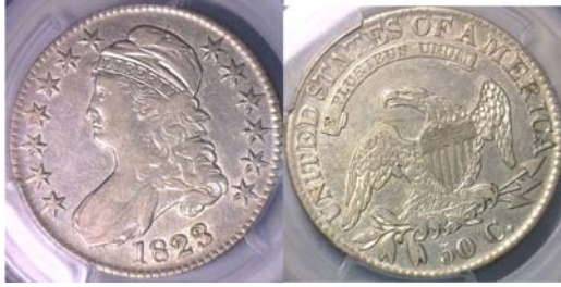
An 1823 Lettered Edge Capped bust half-dollar O-105, R1 certified XF-40 by PCGS [Enlarge image to 200% to view details.]

Unlike the 1823 dated twenty-five cent denomination, over 1.6 million half-dollars were struck with the 1823 date and the date is significant for having a number of desirable collectible Red Book die varieties. These include the Broken 3, the Patched 3, the Ugly 3 and the Normal 3 in the date, the last shown directly above and the most common. With all these special varieties one would think there would be an 1823/2 overdate since they existed on both the cent and dime denominations, but none are presently known.