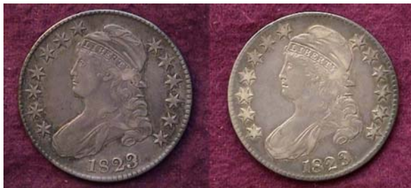
1823 50c obverses of the Patched and Ugly 3 in date die varieties [Enlarge image to 200% to view details.]

Unlike the 1823 dated twenty-five cent denomination, over 1.6 million half-dollars were struck with the 1823 date and the date is significant for having a number of desirable collectible Red Book die varieties. These include the Broken 3, the Patched 3, the Ugly 3 and the Normal 3 in the date, the last shown directly above and the most common. With all these special varieties one would think there would be an 1823/2 overdate since they existed on both the cent and dime denominations, but none are presently known.