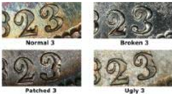
Detailed image of the four main 1823 Bust half-dollar varieties

While the half-dollar had the purchasing power of $11.80 back in 1823, many specimens were stored in banks as specie to back heavy business expenses such as loans for land deals etc. As a result, there are a large number of survivors with eye appeal such as the XF-40 example shown at the top of this column that are reasonably priced. Of the five denominations struck with the 1823 date, the fifty-cent coin is the most common and the least expensive.