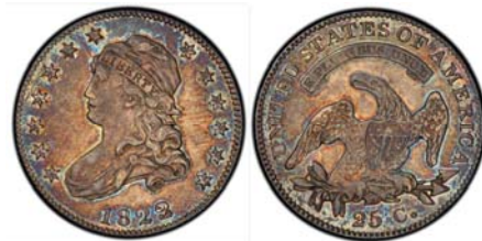
An 1823/2 Capped Bust Quarter graded AU-58 by PCGS [Enlarge image to 200% to view details.]

Only 17,800 quarters were struck in 1823 and the date is considered one of the great rarities of US coinage. Out of this total figure, numismatic scholar, Steve M. Tomkins and author of Early United States Quarters (1796-1838) --released in 2008--believes just 1,800 were actually struck with the 1823 date. As a result, it is unlikely that most collectors of United States obsolete coins will be able to add even a Good-6 specimen to their collection. The PCGS certified AU-58 specimen shown sold for $246,750 at the D. Brent Pogue Sale Part 1 held by Stack's-Bowers in 2015 and is tied for finest known.