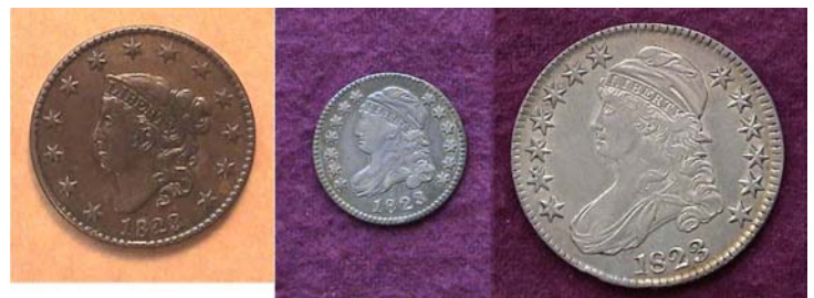
The obverses of the collectible coins of 1823 The Coronet cent, Capped Bust dime and Half-dollar

Despite a severe economic recession known as "the Panic of 1819" and the famed Compromise of 1820 allowing Missouri to be admitted as the 23 rd state of the union, James Monroe was reelected virtually unopposed as 5 th President of the United States, all this during what historians now refer to as "The Era of Good Feeling". On the other hand, the US coinage produced during this period was somewhat uneven with no more than three to four denominations struck in a single year.