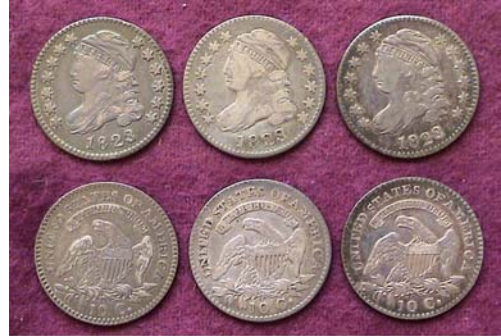
The three 1823 Capped Bust dime varieties, JR-1, JR-2 & JR-3 [Enlarge image to 500% to view details.]

The 1823 normal date Coronet cent shown on the bottom of column one is a much lower grade example and was acquired at a small commercial show held in Mt. Holly, NJ back in the summer of 1990. It was sold "raw" as an Fine-12 but in reality is closer to a VG-10 at best. Recent auctions of this particular date and grade published on PCGS' COINFACTS suggest that many similarly graded coins appear with far rougher surfaces and grayish color than the coin shown here which displays a relatively smooth surface. However, its ultra tan appearance suggests the coin may have been retoned.