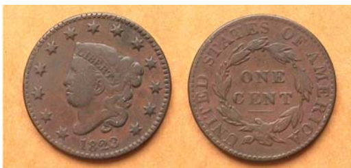
The scarcer 1823 normal date cent, N-2, R4, grading VG-10 [Enlarge image to 500% to view details.]

PCGS's COINFACTS estimates that 1,622,000 cents were struck in 1823 which included just two die varieties, the 1823/22 over-date and the somewhat scarcer normal date. Both varieties are considered scarce to very scarce and from AU thru mint-state, rare to extremely rare. The 1823/2 example was acquired at a Whitman sponsored regional show held in Atlanta in May, 2005. It has nice color and lots of eye appeal.