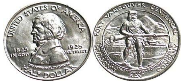
1925 Fort Vancouver Commemorative Half-Dollar, Mintage: 14,994.

The author was somewhat unfamiliar with Arno’s next topic of discussion - commemorative half-dollars of 1925. In addition to the Stone Mountain half (which is commonly known) Arno discussed three rare and much less known half-dollar coins: The Lexington Concord sesquicentennial (mintage 162,013); The California Diamond Jubilee (86,594); and the scarce Fort Vancouver Centennial Memorial (50,028 coins were minted, but 35,034 were melted, so the remaining official mintage is only 14,994 coins; how many of these still exist is not known.