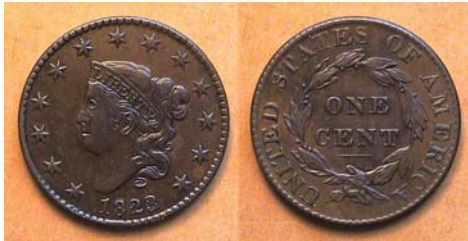
An 1823/2 N-1, R2 Coronet large cent, R3 grading XF-40 [Enlarge image to 500% to view details.]

Under the provisions of the Coinage Act of 1792, ten denominations were authorized, two in copper, the half-cent and large cent, five in silver, the half-disme, disme, quarter, half-dollar and dollar and three in gold, the $2.50 quarter eagle, $5.00 half-eagle and $10.00 eagle. During the first fifty-six years of our coinage which began officially in 1793, the striking of all ten denominations in a single year occurred just once, in 1796. During the early years, gold and silver were in short supply and our copper planchets had to be imported from the firm of Matthew Boulton in Soho, Birmingham England. From 1805 thru 1830, several of our denominations were suspended or struck erratically. Americans living during this period depended on the many Latin American silver coins to supplant the low mintage US pieces which contained .903 fine silver and accepted by tradesmen as payment for goods sold. In 1823, The US Mint in Philadelphia struck only five denominations, the cent, dime, quarter, half-dollar and $5.00 half-eagle