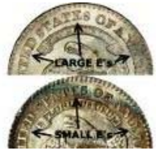
Detail of lg. & sm. E's

The reported mintage for dimes struck in 1823 was 440,000 of which only three die varieties are known, one with small Es in the legend on the reverse, JR-1 and two with a large E in the same places, JR-2 & JR-3. Of the three, only the second variety shown in the center is scarce, rated an R5 on the rarity scale.