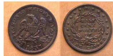
An 1837 Hard Times token grading XF-45

The 1831 Classic Head half cent shown above underwent this process but it was sold by the dealer to the owner in full knowledge of the procedure. An actual legitimate 1831 in this AU to BU grade would cost around $50,000 to while the Electrotype shown above sold for just $250.