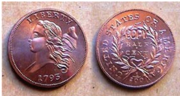
A 1793 Liberty Cap Half-cent Replica struck by the Gallery Mint [Enlarge the page to fill monitor screen to view the details of all examples.]

There are some rare coins that are just too expensive for most collectors to acquire but occasionally there are options the collector has to at least obtain a replica of an acknowledged rarity. Take the 1793 Gem BU half-cent shown as an example.