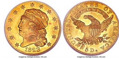
The finest known 1823 $5.00 Half-Eagle certified MS-65 by PCGS The coin was from the Henry Miller collection and sold for $299,000 at the Heritage Sale in Jan. 2011

While the half-dollar had the purchasing power of $11.80 back in 1823, many specimens were stored in banks as specie to back heavy business expenses such as loans for land deals etc. As a result, there are a large number of survivors with eye appeal such as the XF-40 example shown at the top of this column that are reasonably priced. Of the five denominations struck with the 1823 date, the fifty-cent coin is the most common and the least expensive.