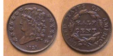
An 1831 Classic Head Half-cent struck as an electrotype

The coin was one type of a number of early copper coin replicas struck in the early 1990s by Ron Landis, founder and Chief Engraver of the Gallery Mint in Eureka Springs, Arkansas. A authentic certified MS-65 example of a real 1793 half-cent recently sold at auction for $240,000 Heritage auction but the full Red MS-67 replica shown cost collectors just $8.00 apiece when these coins with the word COPY on one of its sides were released.