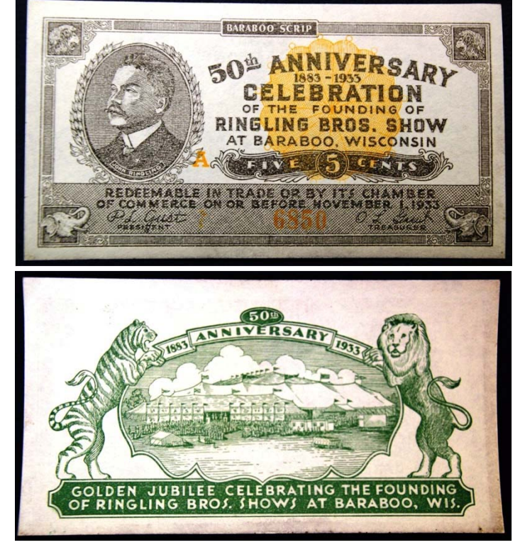
The face and back of the Five cents script