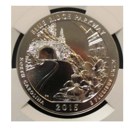
Robbie Ogden displaying 5 ounce Blue Ridge Parkway commemorative housed in a NGC-MS-69 holder