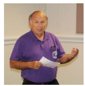
Dick Lasure: 1909-S VDB cent