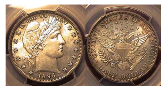
Arno Safran displayed this 1895 Barber Half-dollar graded MS-63 by PCGS [Enlarge page to fit monitor screen top view details.]