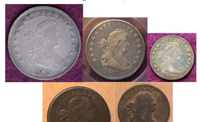
The obverses of an 1807 Draped Bust type coins (excluding gold) 50c, 25c & 10c over 1c & \frac{1}{2} ¢

Collecting the US Coins of 1807 (excluding gold) 210 Years Ago By Arno Safran