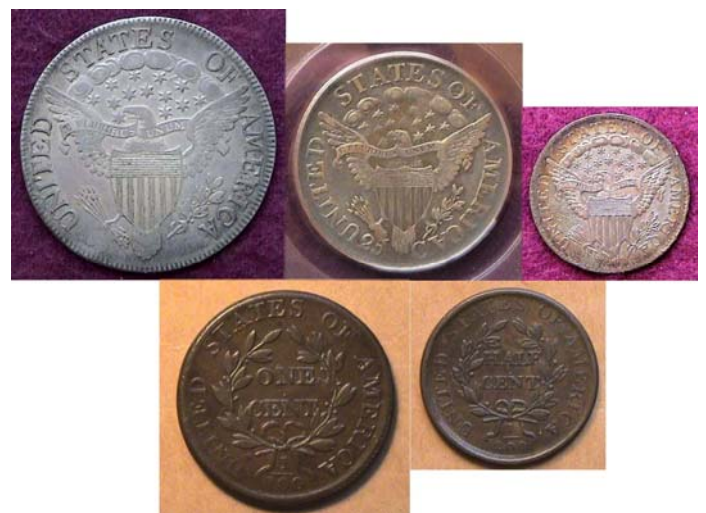
The reverses of an 1807 Draped Bust type coins (excluding gold) [Enlarge page to fit monitor screen to view details.]

Today many of the Draped Bust denominations are priced two to three times above what they retailed at the turn of the 21st century. Despite these current realities, if the collector either has the means or can find a way to save enough cash to acquire attractive certified specimens grading anywhere from FINE-12 thru AU-50, the acquisition of these cons from 1807 will be well worth the price. This is due not only to their overall artistry by first Chief Engraver, Robert Scot but as sound investments, since their value is bound to increase even further due to their limited supply and greater demand.