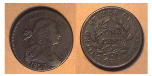
The 1807/6 Draped Bust cent, S-273, R1 (grading VF-30

In the early years of the 19th century the cent was the workhorse of the economy and as a result it circulated heavily. The S-275 example shown above is one of the two varieties displaying the large fraction 1/100 ( located on the bottom of the reverse ) and has an attractive chocolate-brown appearance which is somewhat less common as most specimens in this grade appear slightly off color and drab. This coin was acquired in 1990 at a local coin shop in the area the author used to live and its value has doubled since then. In 1807, a cent had the purchasing power of 21 \notin .