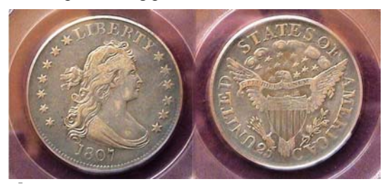
An 1807 Draped Bust quarter, B-1, R2 graded VF-35 by PCGS [Enlarge page to fit monitor screen to view details.]

In the early years of our republic, the ten cent denomination was spelled disme , ( a term attributed to the French which could have been pronounced either <u>deem</u> or <u>dime</u> with a <u>silent s.</u>) In 1807, a dime had the purchasing power of $2.10.