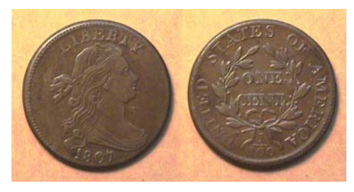
An 1807 Draped Bust cent S-275, R3 grading XF-40,

The coin shown above has attractive chocolate brown surfaces with sharper detail on the reverse relative to a grade of VF. It was acquired back in 1988 when the price was less than $75.00. In 1807, the \frac{1}{2} ¢ had the purchasing power of 11¢.