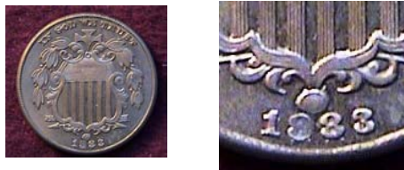
The obverse of an 1883 Shield nickel, with detail of re-punched date Designated Breen #2523 or RPD FS-312 [Use a 3X magnifying glass or magnify page to 200% to view details.]

This particular coin shows a re-punched date with the remnants of the original appearing below it. It catalogs as #2523 in the Shield nickel chapter in Walter Breen's Encyclopedia of US and Colonial Coins . It also is listed in “ The Cherry Picker's Guide... ” by Bill Fivaz and J.T. Stanton.