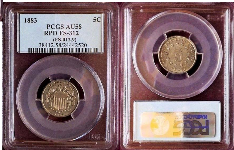
The 1883 Shield nickel with dropped date certified AU-58 by PCGS [Use a 3X magnifying glass or magnify page to 200% to view details.]

me the coin at the agreed price. As the years went on it became more apparent that this particular variety was extremely uncommon. In the 1990's I finally came across a lower grade specimen at a commercial show in which the dealer was asking $1,500. Could this coin really be worth that much? When the “Cherry picker's Guide...” came out I looked to see if the particular 1883 Shield nickel variety was mentioned and sure enough, there it was on the final page of the Shield nickel series. It was listed as a Rarity 6, between 17 to 32 pieces known, in other words “RARE”. There were two other factors that accompanied the listing: Interest level and Liquidity. In each case these were given the number 3, (i.e., better than average interest by collectors, and the variety was worth a premium to specialists.) Therefore, at the recently held FUN Show in Orlando last January, I submitted the 1883 dropped date coin to PCGS and the 1883 Shield nickel came back certified AU-58.