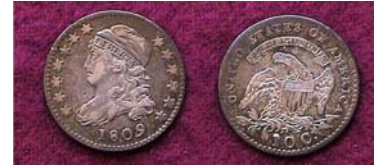
An 1809 Capped Bust dime JR1, R4 (18.8 mm.) [Use a 3X magnifying glass or magnify page to 200% to view details.]

Living in central New Jersey during the 1980's and '90s made it possible for one to drive either south to Philadelphia or north to New York City in less than two hours. The big problem was once you got there, one had to find a place to park and it was expensive. That was not going to keep an avid coin collector from attending one of the major coin shows and so it was in March of 1988, I made the trip along the NJ T'pke through the Holland Tunnel into lower Manhattan in order to attend the Metropolitan NY Coin Show. Back then, it was held in the spacious basement of the World Trade Center.