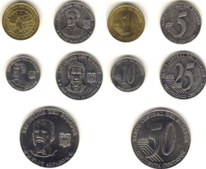
Modern Ecuadorian coinage

[Use a 3X magnifying glass or magnify page to 200% to view details.]