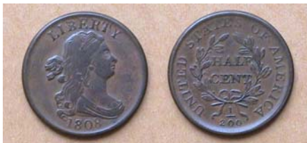
An 1808 Draped Bust Half Cent, C-3 R1 grading VF-25 The diameter was 23.5 mm, approx. 7/8 inches [Use a 3X glass or magnify to 200% to see details more clearly.]

This particular cent date was chosen as it was not used on any of the five silver denominations but with the exception of the 1796, 1799 and 1804, the remaining dates of the Draped Bust cent series are common and from Good-4 through Fine-12 would not be as pricey as the Extra Fine example shown above. Many large cent collectors attempt to acquire their pieces by die variety and cannot afford high-end specimens. They seek coins grading G-4 to VG-10 that appear chocolate brown in color with smooth even surfaces, free of digs, cuts or rim nicks.