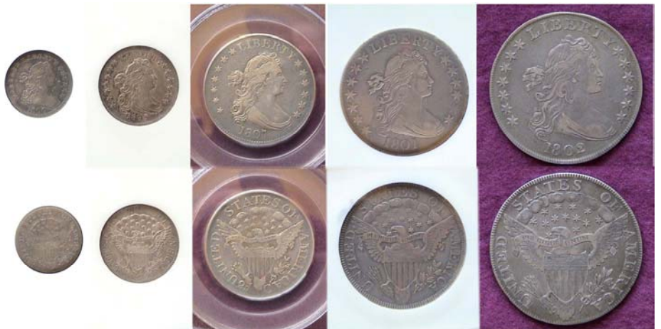
The Draped Bust Silver Set (not actual size) 1800 5¢, 1805 10¢, 1807 25¢, 1801 50¢ and 1802 $1.00 [Use a 3X glass or magnify to 200% to see details more clearly.]