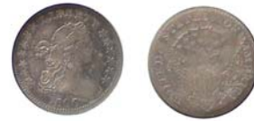
An 1800 Draped Bust/ Heraldic Half Dime graded Fine-15 by NGC The diameter was 16.5 mm [Use a 3X glass or magnify to 500% to see details more clearly.]

The first US dimes, (originally spelt dismes ) were struck in 1796 and 1797 and bore the Draped Bust obverse but with the small eagle reverse. From 1798 thru 1807 Draped Bust dimes with the Heraldic eagle reverse were issued but with the exception of the more common 1805 and 1807 dated pieces, the preceding dates had mintages mostly in the low five figures and are quite scarce. No dimes were dated 1799 or 1806. During the past ten years, the increased collector demand for early US type has minimized the available supply to a trickle resulting in huge price increases for even the commoner dates. At the time the Draped Bust/ Heraldic dimes were being issued 10¢ had the purchasing power of $1.75.