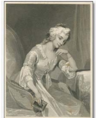
Anne Bingham (1764-1801)

Pictured above is the majestic dollar design of Robert Scot. The reported mintage for the 1802 $1.00 was just 41,650. Scot was appointed as our first Chief Engraver of the US on Nov. 23, 1793 and remained in that position until 1823, the year he died. Born in Scotland, Scot arrived in Colonial American in 1778 and in 1781 engraved some medals for Thomas Jefferson who was Governor of Virginia at the time. His first US designs were the Flowing Hair half dime, half dollar and dollar coins of 1794-95 and they were not impressive, but after being shown a sketch by renowned portrait artist Gilbert Stuart and others made of the beautiful 21 year old Anne Willing Bingham, Scot created a new Draped Bust Liberty design that would adorn our copper and silver coins from 1795 thru 1808.