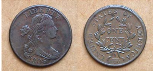
An 1806 Draped Bust Large Cent, S-270 R2 grading XF-45 The diameter was 29 mm, approx. 1 1/8 inches [Use a 3X glass or magnify to 200% to see details more clearly.]

Between 1796 and 1807 inclusive, Robert Scot's Draped Bust rendition of Liberty appeared on the obverses of our large cents. The figure of Miss Liberty seems more tapered than on the silver coinage. The overall design is simpler showing no stars surrounding the figure; just the word LIBERTY above and the date below. The reverse shows a Laurel wreath with berries and the denomination ONE CENT at the center with a tiny dot in-between. The legend, UNITED STATES OF AMERICA is arranged moving clockwise around the circumference of the coin from the fraction 1/100 that is centered at the bottom between the two strands of the ribbon. Above are two stems. (On some dates and varieties, the stems may be missing. Since there is only one known variety for the 1806, the design is complete as Scot conceived it.)