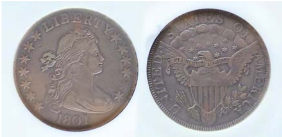
An 1801 Draped Bust/ Heraldic Eagle Half dollar, O-102, R4 Diameter, 32.5 mm. The coin was graded XF-40 by NGC [Use a 3X glass or magnify to 200% to see details more clearly.]

Scot did not get around to placing the Heraldic Eagle reverse on the half dollar denomination until 1801 because no half dollars were needed during the years 1798 thru 1800. Only 30,289 were reportedly struck in 1801, just 29,890 in 1802 and 183,234 in 1803. None were struck with the 1804 date. The 1805 thru 1807 issues are more common and less expensive.