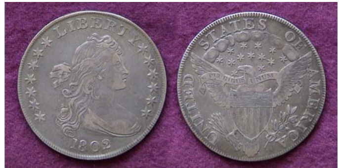
An 1802 Draped Bust/ Heraldic Eagle $1.00; diameter, 39-40 mm It was designed by our first Chief Engraver, Robert Scot [Use a 3X glass or magnify to 200% to see details more clearly.]

Pictured above is the majestic dollar design of Robert Scot. The reported mintage for the 1802 $1.00 was just 41,650. Scot was appointed as our first Chief Engraver of the US on Nov. 23, 1793 and remained in that position until 1823, the year he died. Born in Scotland, Scot arrived in Colonial American in 1778 and in 1781 engraved some medals for Thomas Jefferson who was Governor of Virginia at the time. His first US designs were the Flowing Hair half dime, half dollar and dollar coins of 1794-95 and they were not impressive, but after being shown a sketch by renowned portrait artist Gilbert Stuart and others made of the beautiful 21 year old Anne Willing Bingham, Scot created a new Draped Bust Liberty design that would adorn our copper and silver coins from 1795 thru 1808.