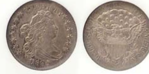
An 1805 Draped Bust dime graded AU-58 by NGC. The diameter was 19 mm compared with 17.9 for dimes struck from 1837 on. [Use a 3X glass or magnify to 200% to see details more clearly.]

expensive even in as low a grade as Good-4. The 1805, '06 and '07 had ample mintages in the six figures; the reported mintage of the 1807 shown at 220,643. The three dates are priced similarly but become expensive above Fine-12. Certified graded specimens are advised for all Draped Bust silver coins in the current numismatic market.