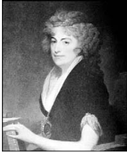
Anne Bingham in 1797 Painting by Gilbert Stuart

The Draped Bust silver series can be broken down into two sub-types; the small eagle reverse (very expensive today) and the large or Heraldic Eagle reverse (which is more affordable although still pricey.) In 1798, the reported mintage of Bust dollars was 327,536, the vast bulk of these being engraved with the popular large Heraldic eagle reverse. In 1799, the reported mintage increased to 423,515, a whopping number of cartwheels for that period. After 1800, the reported mintages languished in the five figures and though scarcer are only slightly more expensive than the 1798-1800 dates.