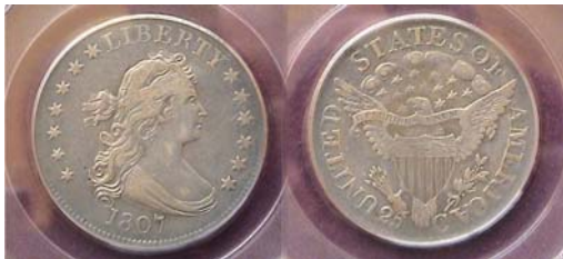
An 1807 Draped Bust Heraldic Quarter graded VF-35 by PCGS The diameter of the Draped Bust quarter was 27.2 mm. [Use a 3X glass or magnify to 200% to see details more clearly.]

Scot did not get around to placing the Heraldic Eagle reverse on the half dollar denomination until 1801 because no half dollars were needed during the years 1798 thru 1800. Only 30,289 were reportedly struck in 1801, just 29,890 in 1802 and 183,234 in 1803. None were struck with the 1804 date. The 1805 thru 1807 issues are more common and less expensive.