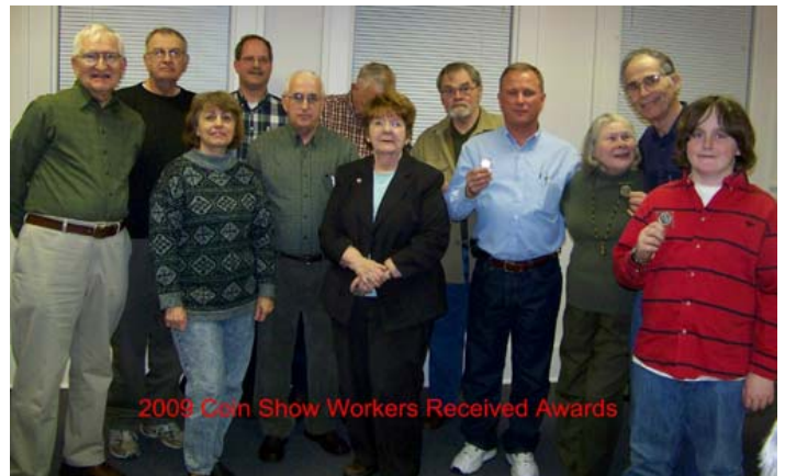
2009 Coin Show Workers Received Awards