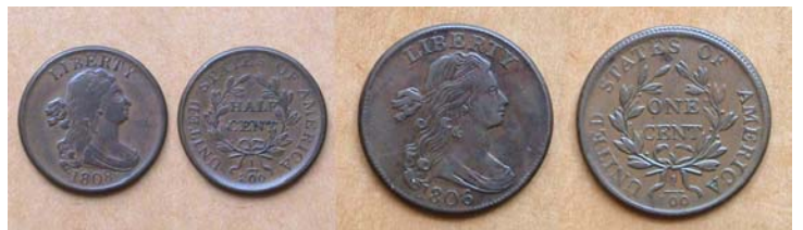
The Draped Bust Copper Set; 1808 ½¢ and 1806 1¢ (not actual size) [Use a 3X glass or magnify to 200% to see details more clearly.]