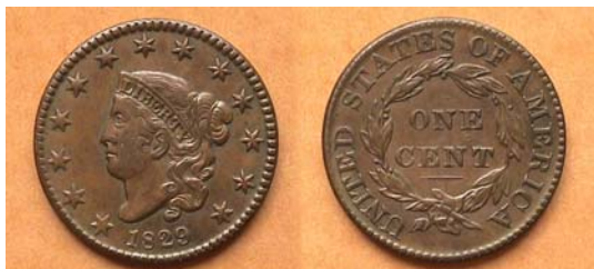
An 1829 Matron Head large cent, N-8, R1 graded XF-45 [Magnify page to 200% to view details of coin more clearly.]

The reported mintage for the 23.5 mm diameter 1829 Classic Head half-cent was 487,000 with only one known die variety. It is considered a common date that was less used at the time which resulted in no 1830 dated half cents being minted. The specimen shown is an early die variety. An XF-45 example is still very reasonably priced. The coin was acquired at a local coin club meeting back in 1988 when it was not uncommon to see a few dealers set up around the meeting room.