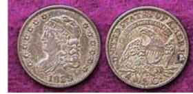
An 1829 Capped Bust half-dime, LM-13, R1 graded AU-58 by NGC [Magnify page to 500% to view details of coin more clearly.]

was 1,414, 500. There are nine known varieties for the date. Of these, six come with the more common larger letters in the legend UNITED STATES OF AMERICA on the reverse and three with slightly smaller letters which are much scarcer and more costly. At that time the cent was 28-29 mm in diameter The coin shown was acquired away back in 1991 at the Metropolitan Coin Show held in New York which was only 65 miles from the author's home near the Jersey shore.