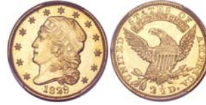
An 1829 Classic Head reduced diameter $2.50 quarter eagle, BD-1, R4 certified MS-63 by PCGS The example realized $41,125 at a Heritage Auction [Magnify page to 200% to view details of coin more clearly.]

Only two gold denominations were coined in 1829, the $2.50 quarter eagle and $5.00 Half eagle, the $10.00 eagle having been suspended after 1804. In 1829, the $2.50 quarter-eagle was reduced in diameter from 20 mm to 18.2 mm. The dates, letters and stars were also reduced in relation to the smaller diameter while the Bust of Liberty on the obverse was changed slightly. The reported mintage for this date was just 3,403, the lowest of the run (1829-34) but is the most common of the short series because most were saved. Despite those facts, the coin is relatively expensive in all grades starting with a retail value of $10,500 in XF-40 according to PCGS' COINFACTS . The exquisite example of the coin shown above was graded MS-63 by PCGS and sold for $41,125 in June, 2013, presumably at the Long Beach, California convention.