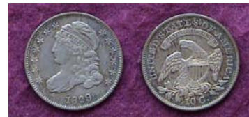
An 1829 Capped Bust dime, JR-12, R3 certified XF-45 [Magnify page to 500% to view details of coin more clearly.]

The short series was coined from 1829 thru the first part of 1837 inclusive with most dates over a million struck each year. Only the 1832 with 965,000 and the first part of 1837 with 857,000 struck fall below those figures. Later in 1837, a the Liberty Seated no stars design replaced the Bust type.