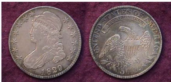
An 1829/7 Capped Bust half-dollar, O-101a R1 graded AU-50 [Magnify page to 200% to view details of coin more clearly.]

Since a half-dollar had the purchasing power of $13.60 during this period, most Americans seldom needed one as prices for basic goods were well below what they are today and the smaller change in circulation was sufficient. As a result, the contemporary collector can acquire most dates of the Lettered edge Capped Bust half-dollar series at modest prices.