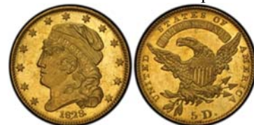
An 1829 reduced size $5.00 gold half-eagle graded MA-61 by PCGS The coin realized $431,235 at the Heritage Auction held at the FUN Show January, 2012 [Magnify page to 200% to view details of coin more clearly.]

There were two sub-types struck in 1829 for the $5.00 gold half-eagle, the large size and reduced size. The reported mintage for the large size is listed at 25,375 but only five business strikes are known, four of which are uncirculated and one, a worn down to VG jewelry piece along with two proofs. The date is actually rarer than the 1804 dollar of which 15 pieces are known. There is zero likelihood that anyone who is not a billionaire is likely to afford one and even members of that fraternity will have to wait until another specimen surfaces.