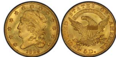
A "Gem" 1829 large size $5.00 half-eagle graded MS-66+ by PCGS The coin realized $763,750 at the Brent Pogue sale held by Stacks, Bowers and Sotheby's in May, 2016 [Magnify page to 200% to view details of coin more clearly.]

Only two gold denominations were coined in 1829, the $2.50 quarter eagle and $5.00 Half eagle, the $10.00 eagle having been suspended after 1804. In 1829, the $2.50 quarter-eagle was reduced in diameter from 20 mm to 18.2 mm. The dates, letters and stars were also reduced in relation to the smaller diameter while the Bust of Liberty on the obverse was changed slightly. The reported mintage for this date was just 3,403, the lowest of the run (1829-34) but is the most common of the short series because most were saved. Despite those facts, the coin is relatively expensive in all grades starting with a retail value of $10,500 in XF-40 according to PCGS' COINFACTS . The exquisite example of the coin shown above was graded MS-63 by PCGS and sold for $41,125 in June, 2013, presumably at the Long Beach, California convention.