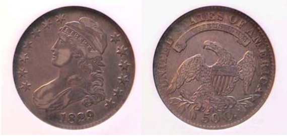
An 1829 Capped Bust half-dollar, O-104a, R3 graded XF-45 by NGC [Magnify page to 200% to view details of coin more clearly.]

The 1829 lettered edge Capped Bust half-dollar had a reported mintage of 3,712,156 pieces and is considered a common date. The coin type was 32.5 mm in diameter.