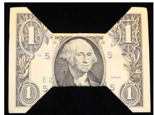
Bow Tie Origami from Robbie Ogen