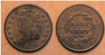
An 1829 Classic Head half-cent graded XF-45 [Magnify page to 200% to view details of coin more clearly.]

The mintages for the 1829 coins shown above were all fairly common, so a collector on a middle class discretionary income desirous of completing circulated examples of the five should have little trouble finding specimens between the grades of Fine-12 and VF-20. at modest prices. For those who yearn for coins with greater eye appeal, the grade of VF-30 to XF-45 will cost somewhat more but not nearly as much as those grading AU-50 and uncirculated.