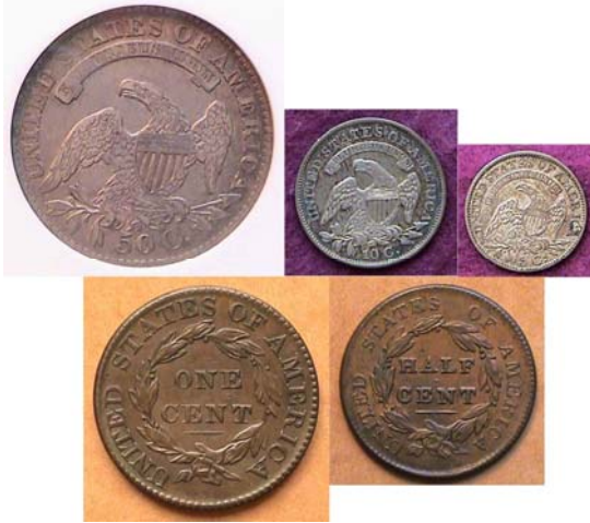
The reverses of the collectable portion of an 1829 year set The silver half-dollar, dime and half-dime over the copper large cent and half-cent [Magnify page to 200% to view details of coin more clearly.]

The mintages for the 1829 coins shown above were all fairly common, so a collector on a middle class discretionary income desirous of completing circulated examples of the five should have little trouble finding specimens between the grades of Fine-12 and VF-20. at modest prices. For those who yearn for coins with greater eye appeal, the grade of VF-30 to XF-45 will cost somewhat more but not nearly as much as those grading AU-50 and uncirculated.