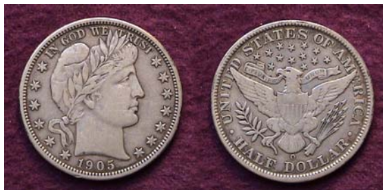
A 1905-O Barber half grading VF 30 from the author's collection

During its 24 year run, Barber halves were produced at four Mints; in Philadelphia (no mint mark) and San Francisco, (S) (1892 to 1915 inclusive) at New Orleans, (O) (1892 through 1909) and at Denver, (D) (1906–1908, 1911–1913 and 1915.) The mint mark was placed on the reverse and centered under the eagle's tail feathers. In all, there are 73 collectible issues required to form a complete set.