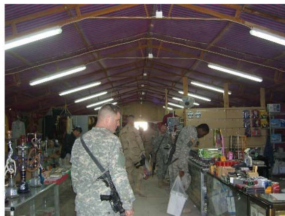
Soldiers browse at the PX Bazaar in Tikrit, Iraq

In the bazaar there were 5 dinars (P80c), 100 dinars (P84b), 250 dinars (P85 & P88) and 10,000 dinars (P89) available.