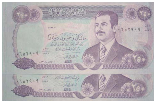
A 250 Dinar Note from Iraq

My last tour in Iraq started my interest in AAFES POGs, which is continuing this tour, but I have had opportunities to pursue other areas of numismatics here as well. In early November I flew to Tikrit to visit the hospital there. In addition to working in the hospital I explored what I could of the base. The PX there had a permanent bazaar. It was a long tent with various merchants in it. A majority of the items for sale did not interest me but my attention was drawn to some items on a counter top. It was stacks of Iraqi notes with Saddam Hussein pictured on them. They were in CU condition. The paper they were printed on was not of regular note quality because the embargo had cut Iraq off from their European printers, so some were printed in Iraq (1990, 1991) and in China (1992, 1993) and were of varying quality.