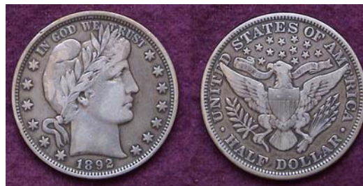
An 1892 Barber Half Dollar grading VF-25 From the author's collection