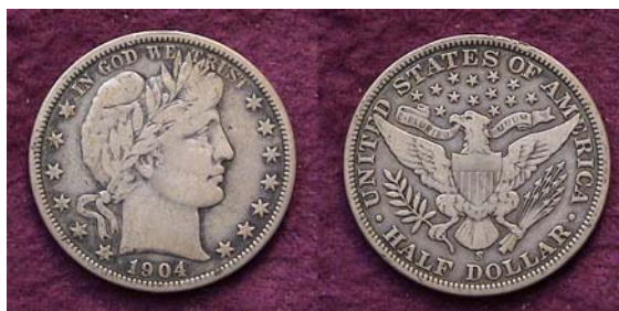
A 1904-S Half dollar grading F-12 from the author's collection

In 2003 I returned to Barber Half collecting; these times to go for the branch mints and complete the set. Upon entering the bourse at the South Carolina Numismatic Association convention, there was a dealer on the right who had a fairly good size display of Barber halves, and lo and behold, there it was; a 1904-S graded FINE right in the middle of the pack. While not a "stopper", this was the key date of the entire series in all grades above Good-6. The coin looked "original" with all seven letters of the word LIBERTY visible, if some just barely. Since 2006, the Red Book describes FINE-12 as showing "LIBERTY nearly completely legible, but worn." These two key words, "nearly" and "legible" are a departure from ( not "completely readable" as seen in earlier editions ). Fortunately there are other factors required to ensure the grade of FINE. On the reverse there was a strong definition of the overall design with the motto E PLURIBUS UNUM clearly shown on the ribbon above the eagle. Only a couple of minor rim bruises kept the coin from being a FINE-15.