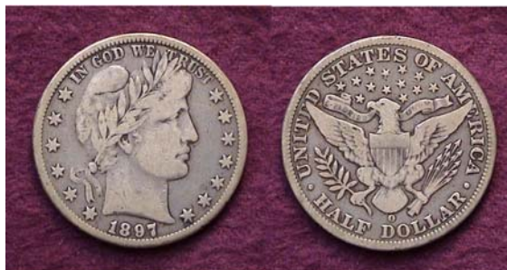
An 1897-O Barber half grading Fine-12 from the author's collection

There are a number of other 'tough' dates that are difficult to find in Fine-12 to VF. Second to the '04-S is the 1897-O and right behind it, the 1897-S and 1898-O.