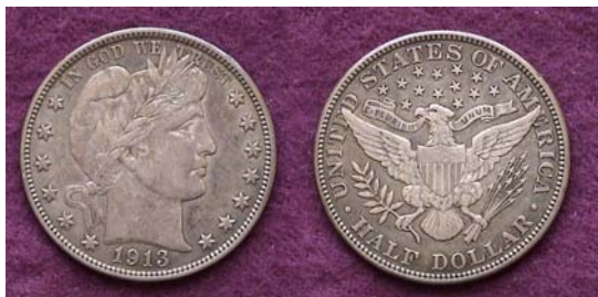
A 1913 Barber Half dollar grading XF-45 from the author's collection

Back in 1992, in commemoration of the 100 th anniversary of the Barber silver series, this collector decided to assemble an 1892-1915 Philadelphia Mint set of Barber halves grading Fine-12 thru VF-35; perhaps an occasional XF-40 to 45 if it appeared original and not "blast white" in order to blend in with the natural gray color of the Fine-VF pieces. The project took 1½ years to complete. The first acquisition was dated 1901, very common, having the fourth highest mintage of 4,268,813. It was a lovely gray coin graded Fine-15 (today's VF-20). The last Philadelphia Mint acquisition turned out to be the elusive 1905. With a mintage of only 662,727, it represented the eleventh lowest of the entire 73 piece set. The piece graded Fine-12 (today's 15). What about the three key dates? The 1913, (188,000) 1914 (124,230) and 1915 (138,000). As these turned out; they were all available for a price. The 1913 acquisition was purchased as a type coin back in 1990 because it was a beautiful original gray specimen grading XF-40 (today's 45 or 50) at the time, very reasonably priced. It blended so well with the rest of the set I decided not to go for a lesser grade piece.