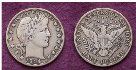
A 1914 Barber Half Dollar in Fine-15; more available than the 1905.

As a collector, I have found the Barber half series to be one of the most challenging. My aim is to complete the set by year's end while upgrading the weaker more common date pieces. Because coin market prices have been rising steadily since 2002, the only way to accomplish this goal is to sell of the lower grade specimens for the better ones. For those similarly inclined, happy hunting!