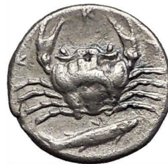
AKRAGAS in SICILY 420BC Eagle Crab Fish

He followed this by showing many examples of ancient coins with marine life on them. He even showed examples of coins made in the shape of fish! According to Jerry, "The fish symbolizes "abundance" and "perseverance". It is a very ancient and powerful Chinese symbol which expresses the wish for prosperity year after year."