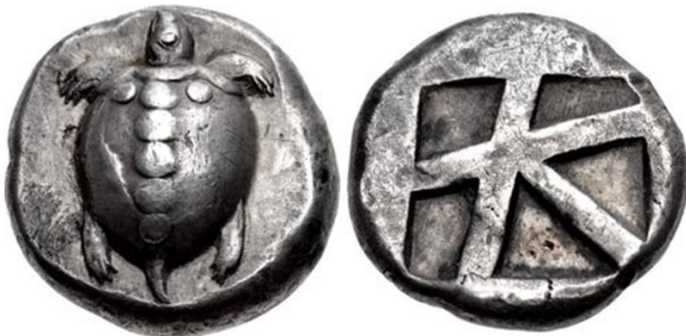
A Silver Stater from Aegina (Millions were struck)

In reviewing his presentation one notices that many countries, in addition to Niue, focused on shark motifs, many of which are in color, such as: Chile / Easter Island (Hammerhead sharks); Palau (Gray Reef Shark); Australia (Tiger, Hammerhead, Great White sharks); Canada (Canadian Great White shark); Niue (Mako Shark coin, minted by the New Zealand mint for Niue).