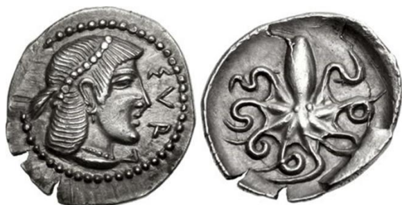
A Silver Litra from Syracuse circa 460BCE