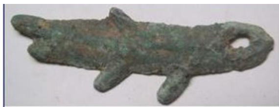
Antique fish coin, Zhou dynasty circa 770 BCE