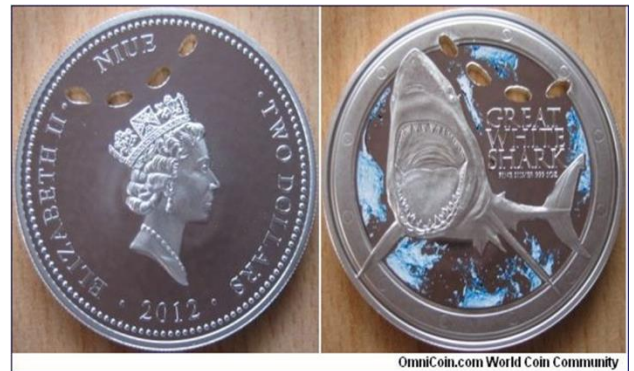
2012 Niue Two Dollar coin “bitten” by a shark

Many of the modern coins take advantage of technical advances in minting to create unique and interesting specimens. For example in 2012 Niue issued a two dollar coin featuring the great white shark. What makes this coin unique? It has been “bitten” by a shark!