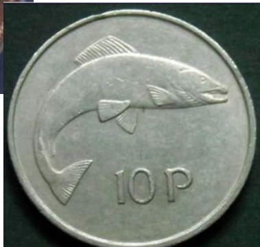
1971 Irish 10 Pence

Many of the modern coins take advantage of technical advances in minting to create unique and interesting specimens. For example in 2012 Niue issued a two dollar coin featuring the great white shark. What makes this coin unique? It has been “bitten” by a shark!