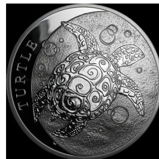
Niue Hawksbill bullion coin Courtesy of https://atkinsonsbullion.com

© 2018 Stephen Kuhl, All Rights Reserved; Not to be Reprinted, Reproduced, Copied, or Distributed without expressed written permission of the Author.