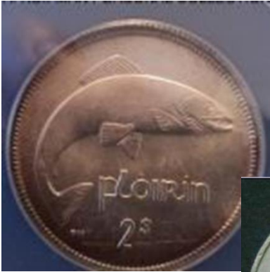
1942 Irish Silver Florin

Moving from the ancient world to contemporary times, Mr. Lipsky listed almost 60 countries which have produced coins with images of sea life on them. He indicated that some of these modern mintages are issued for circulation, while others are issued specifically focused on the collector market and do not circulate monetarily. Circulation examples he showed included two Irish coins, a 1942 Silver Florin and a 1971 10 Pence which used the same salmon design approximately 30 years apart.