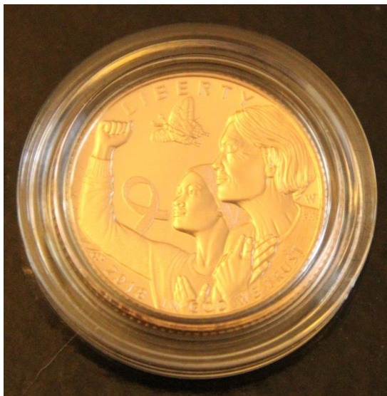
Obverse of 2018 Breast Cancer Awareness $5 Proof presented by Kuhl