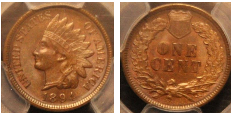
Safran's 1894 PCGS MS65BN Indian Cent