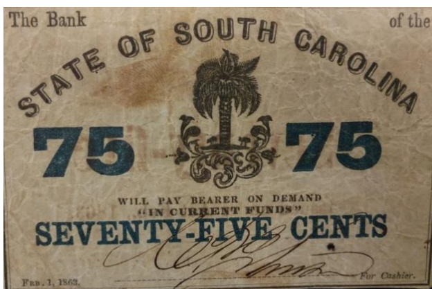
A 75 Cents 1863 South Carolina Fractional note shown by Garry Naples