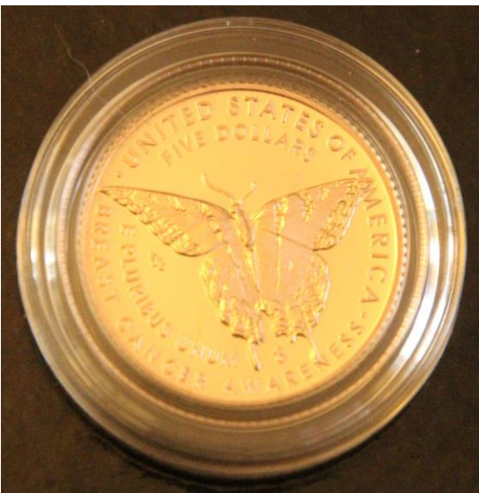
Reverse of 2018 Breast Cancer Awareness $5 Proof presented by Kuhl