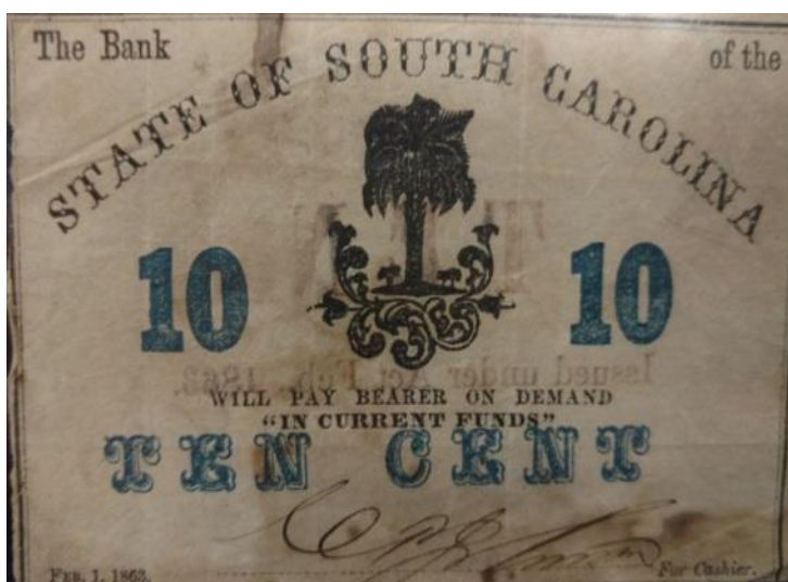
Close-up of Garry Naples' 10 cent SC note from 1863