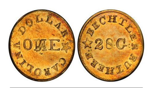
C Bechtler $1 K-4 N Reversed, PCGS MS63, Courtesy PCGS CoinFacts

die crack between the six and seven o'clock position, whereas the gilt brass coin does not. This indicates the gilt brass coin was struck before the gold coins.